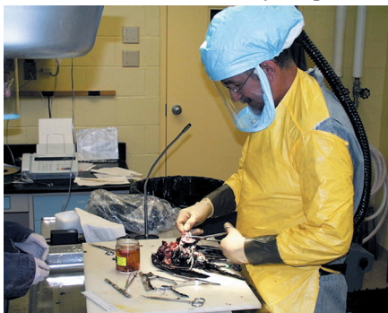
A USGS pathologist examines a suspect West Nile Virus Crow.

In the year 2000, wild bird mortality due to WNV was first detected in May in southeastern New York and northeastern New Jersey. The disease expanded both geographically and in the number and variety of species