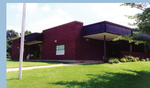
2004: NWHC's current campus has multiple facilities and labs.