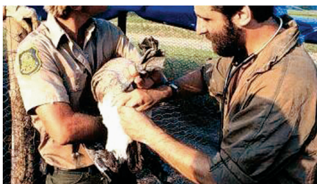
USGS veterinarian places a transmitter on a goose

Large scale wildlife die-offs have occurred throughout the past century, and continue today. In 1973 over 40,000 waterfowl died at a Wildlife Refuge in the first recorded case of duck plague in free flying waterfowl. Avian botulism has killed over a million birds in localized outbreaks in a single year. Avian cholera has killed over 70,000 birds in a single outbreak. Large scale frog and tadpole die-offs are now being reported and investigated throughout the nation. West Nile virus quickly spread across the continent in a matter of years after it was found in New York in 1999.