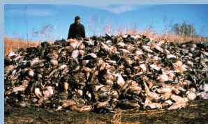
1973: Duck plague kills over 40,000 free-flying waterfowl.