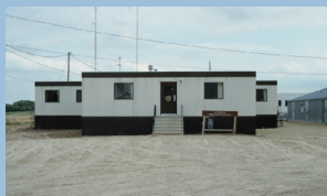
1979: NWHC leaves borrowed space for a new modular unit.