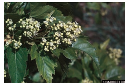
Flowers of Acer ginnala.