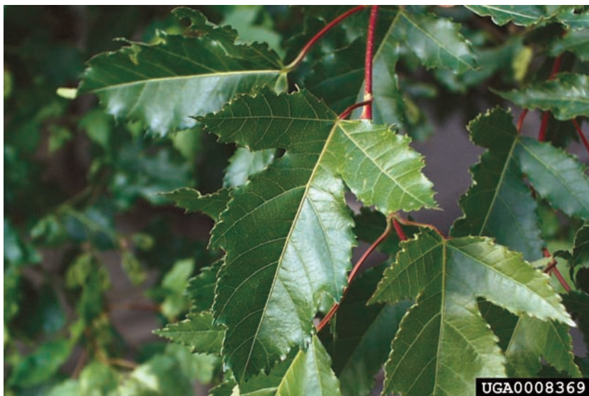
Leaves of Acer ginnala .

Well-known for its brilliant red and orange fall color, Amur maple is a deciduous shrub or woody tree that can reach a height of 5 to 6 m. The bark is coarse, slightly split vertically, and grayish, rarely deep gray or grayish brown. The slender twigs are cylindroid and glabrous. The white lenticels are elliptic or nearly rounded. Winter buds are small, light brown, villous edged, and bear eight scales in an imbricate arrangement. Leaves are papery, oblong ovate to elliptic, 6-10 cm long and 4-6 cm wide, basally round, truncate or subcordate, and 3-5 lobed, with the middle lobe being acute or narrowly