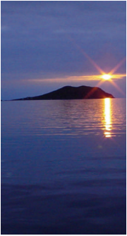
Remote locations pose unique sampling challenges.

Prior to observation beginning in a previously unobserved fishery, the National Marine Fisheries Service collects baseline information on fishing operations and marine mammal interactions. Observer coverage levels are influenced by available funding, the number of participants in the fishery, and program goals. The Alaska Marine Mammal Observer Program wants