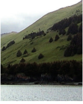
Observers worked in Kodiak in 2002 and 2005.

To work with the AMMOP, observers must have prior observer experience, meet program standards for academic qualifications/ fishing experience and physical fitness, and pass the AMMOP training course. The AMMOP selects observers based on their capability to work independently with limited conveniences. Observers are motivated, possess good judgment, and are able to work in close quarters with fisherman in a professional and respectful manner. AMMOP observers are trained in wilderness preparedness and survival, CPR, and first aid. All observers must pass a physical examination by a licensed physician within six months prior to deployment, ensuring that the observer does not have any health conditions that would jeopardize the safety of the