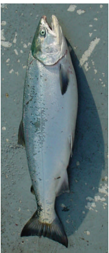
Salmon dominate species recorded by observers.

Observers record information on fishing techniques, gear characteristics, weather, catch and bycatch (including fish, invertebrates, mammals, and birds). Examples of gear information collected are length of net, twine material, mesh sizes, and deterrent devices used. Examples of weather data include sea state, visibility, and tide conditions. Examples of fishing data include the position of the net, set and soak times, time spent picking or hauling, and if appropriate, the time the net is left fishing but unattended; catch data includes the numbers of animals caught by species and condition. Observers collect biological samples and take photographs for species confirmation and to support further scientific research. Examples of this re-