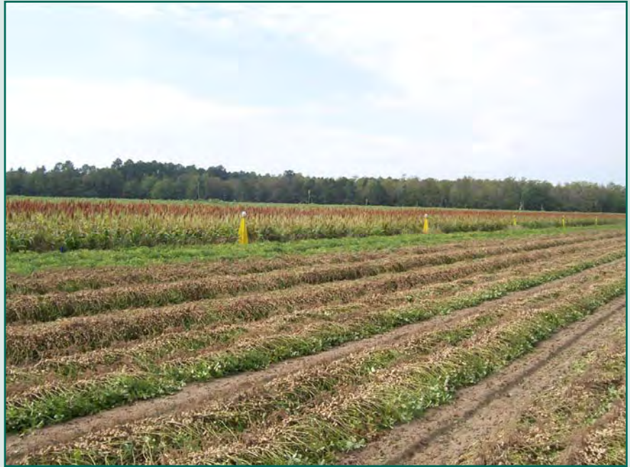
This photo shows a sorghum trap crop with ripe brown seed heads. Yellow pheromone traps for brown stink bug are placed in the first row of sorghum. Cotton is barely visible on the far side of the field in front of the trees. Peanuts are in the foreground. When peanuts are ready for harvest, the plants are turned upside down to allow the peanuts to dry. A few days later a combine comes through to remove the peanuts from the plant. In this photo, the peanuts are inverted. The four rows adjacent to the sorghum are yet not turned. As the peanuts in this field are dug, stink bugs will migrate from the plants into the adjacent sorghum, rather than into the cotton crop.

Growers should sow two plantings of sorghum several weeks apart. That helps pests find the stage of sorghum that is most attractive during the entire cotton season. The sorghum also provides plenty of pollen for the minute pirate bug, an egg predator of stinkbugs. This combination of trap crop and beneficial insect habitat can protect cotton crops from damage by stinkbugs that are migrating from harvested peanut fields.