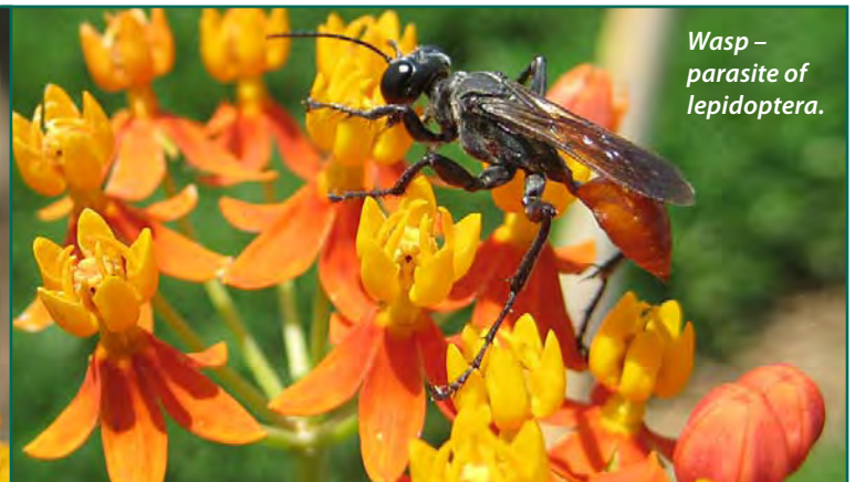
Wasp – parasite of lepidoptera.