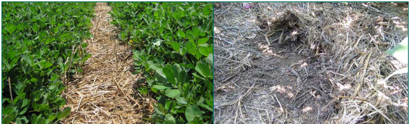
This Georgia farmer planted crimson clover as a cover crop, killed it, then strip tilled peanuts into it. This system attracts many beneficials, improves the soil, provides low-cost nitrogen, reduces soil erosion and conserves soil moisture.

Flame weeding and other thermal devices can reduce broadleaf weeds, but grasses still need to be mechanically removed. For a list of thermal devices and suppliers, see the