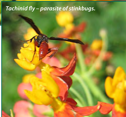
Tachinid fly – parasite of stinkbugs.

Planting milkweed along a field margin supplies nectar and pollen for a wide range of beneficial insects that provide free pest control.