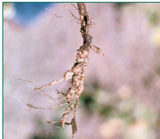
Symptoms of root knot.

Some rotation crops for peanuts are sweet corn, sweet potatoes, cotton, sesame, vegetables, small grains and pastures like Bahia grass. In Australia, tropical peanuts are grown as a companion crop for sugar cane, or as an optional cane fallow legume. In addition to being a profitable extra crop, peanuts provide nitrogen and are resistant to root knot nematodes that are blamed for declining cane yields in lighter cane soils (Peanut Company of Australia, 2006).