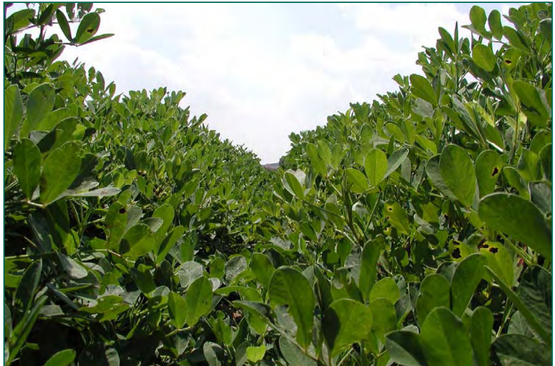
Peanut crop.

Labor and management costs can be much higher for organic peanuts than conventionally grown peanuts. In place of off-farm inputs, organic peanut farmers can use intensive management, maintain high soil fertility, manage weeds through hand hoeing and specialized equipment and manage insects with alternative insect management strategies.