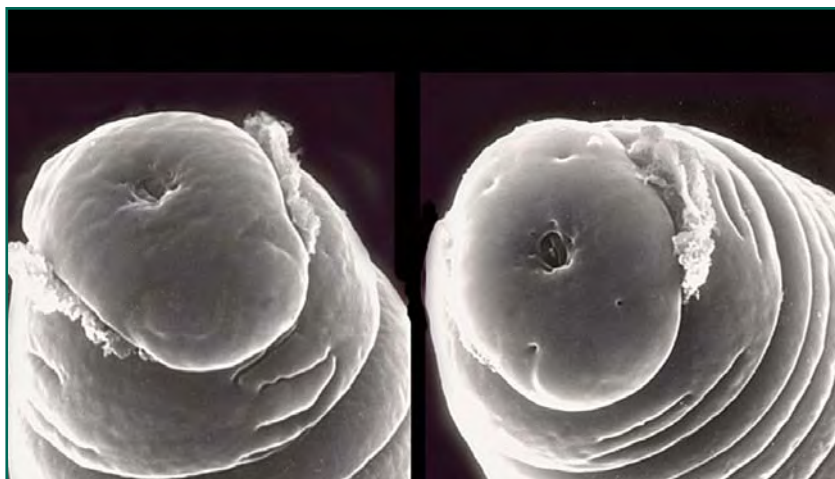
Scanning electron micrograph of the anterior ends of two male root knot nematodes.

There are many types of nematodes in soils. Most are beneficial, but a few are peanut pests. Nematodes that attack peanuts include the root knot nematodes, Meloidogyne arenaria ; M. hapla ; M. javanica , lesion nematode Pratylenchus brachyurus , ring nematode Criconebella and sting nematodes Belonolaimus longicaudatus .