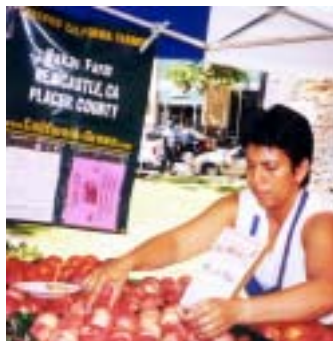
A vendor rearranges fruit at a California farmers market.

There clearly is a valued niche for farmers markets in the food distribution system, as indicated by the robust rate of growth during the past 20 years, and in the equally impressive geographic spread across the urban and rural landscape. Consumers identify farmers markets with a number of positive attributes. In fact, large numbers of supermarkets have developed produce merchandising systems that mimic, to the extent possible, farmers markets. But with growth comes challenges. The farmers market system has reached a level that demands higher levels of management, greater coordination and more effective governance. Some of the spontaneity may be lost in this process, but what may be gained is sustainability and high levels of customer satisfaction. One would have to judge the prospects for continued growth as bright, providing that the challenges are met in a timely, forthright manner. ■