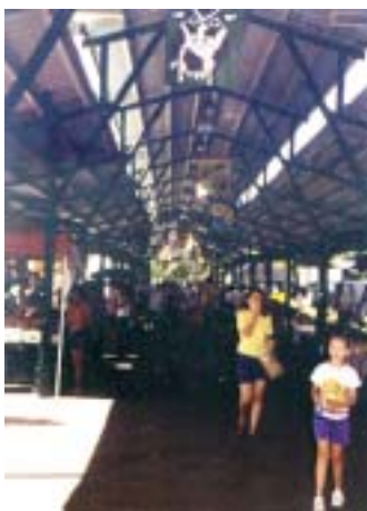
Above and right: Shoppers stroll and a chef prepares a meal at the Davis Farmers Market.

But like other products of a 1970s cultural revolution against 'Wonder Bread' — natural foods, organic foods, herbal remedies, meditation, holistic medicine and others — it tapped a responsive chord among consumers, particularly the post-war 1960s generation. Recall that back in the '60s we were still caught in the web of a 'meat and potatoes' Midwest cuisine. Even in California, iceberg lettuce was de riguer .