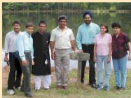
The seven-member Agricultural Development Project for India visited the Small Farm Center this summer.