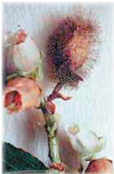
Figure 9. Botrytis Blight