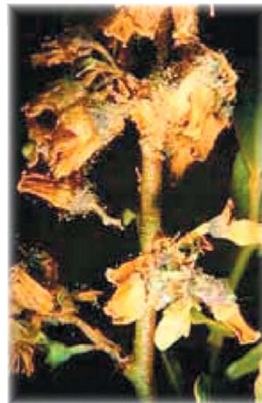
Figure 10. Infected flower clusters