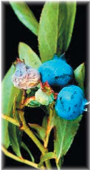
Figure 6. Mummy berry