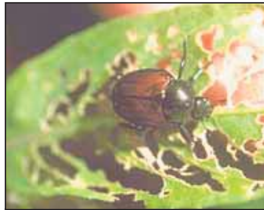
Figure 5. Japanese beetle skeletonizing a leaf.

Organic growers use a number of methods to control these pests. Hand picking, trapping, milky spore disease, and/or beneficial nematodes have all been used by growers with varying degrees of success. The key practices are the use of milky