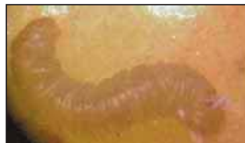
Figure 4. Cranberry fruitworm larva. By C.D. Armstrong. Photo used with permission.

Particularly troublesome in the eastern U.S., the cranberry fruitworm, Acrobasis vaccinii , affects both cranberries and blueberries. It overwinters in the soil as a fully grown larva and completes development in the spring. Adult moths mate and lay eggs from bloom until late green fruit, usually on unripe fruit. The eggs are very small and difficult to see. Young larvae enter the stem end of the fruit and feed on the flesh. They often web berries together with silk. A Michigan study reports that many parasites attack the cranberry fruitworm. The most common larval parasitoid is Campoletis