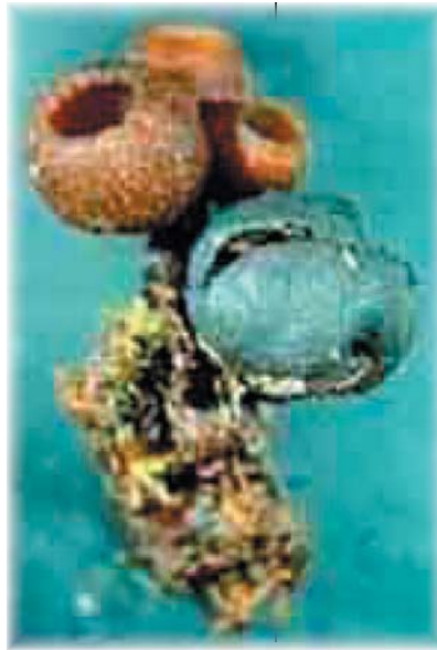
Figure 7. Mummy berry with apothecia