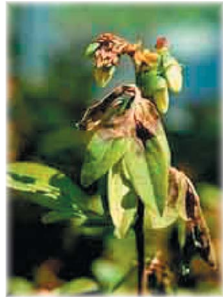
Figure 8. Infected leaves and flower bud