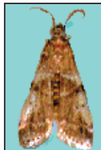
Figure 3. Cranberry fruitworm adult moth.

Particularly troublesome in the eastern U.S., the cranberry fruitworm, Acrobasis vaccinii , affects both cranberries and blueberries. It overwinters in the soil as a fully grown larva and completes development in the spring. Adult moths mate and lay eggs from bloom until late green fruit, usually on unripe fruit. The eggs are very small and difficult to see. Young larvae enter the stem end of the fruit and feed on the flesh. They often web berries together with silk. A Michigan study reports that many parasites attack the cranberry fruitworm. The most common larval parasitoid is Campoletis