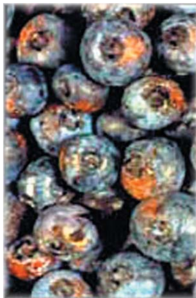
Figure 11. Anthracnose infected fruit oozing out of berry.