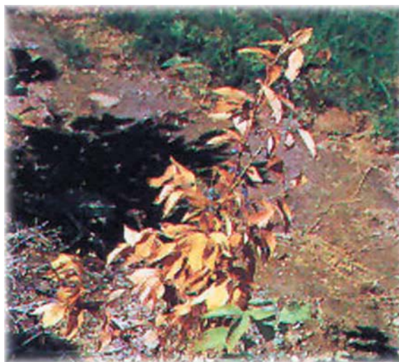
Figure 17. Fusicoccum Canker ( Fusicoccum species)

Fusicoccum is a stem disease causing dieback and general plant decline. This fungus overwinters in cankers. Spores are largely disseminated by rainwater, and cold stress may play a part in increasing disease damage. Removal of infected plant parts is essential for control. Varieties differ in their resistance to this disease.