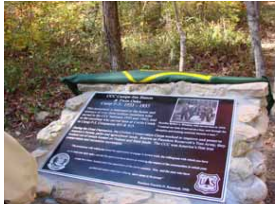
Bronze Monument at Curtis Creek