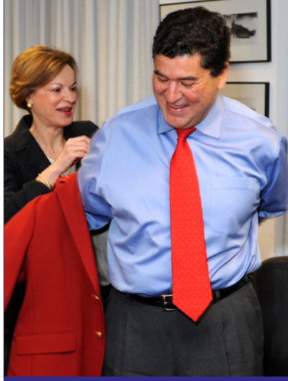
ABOVE • (Red) jacket required. NIH director Dr. Elias Zerhouni makes good on his CFC pledge. See more on p. 7.