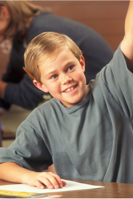
According to a new study sponsored by NIDCD, the type of intervention may matter less to children who struggle to learn language than does the intensity and format of the intervention.