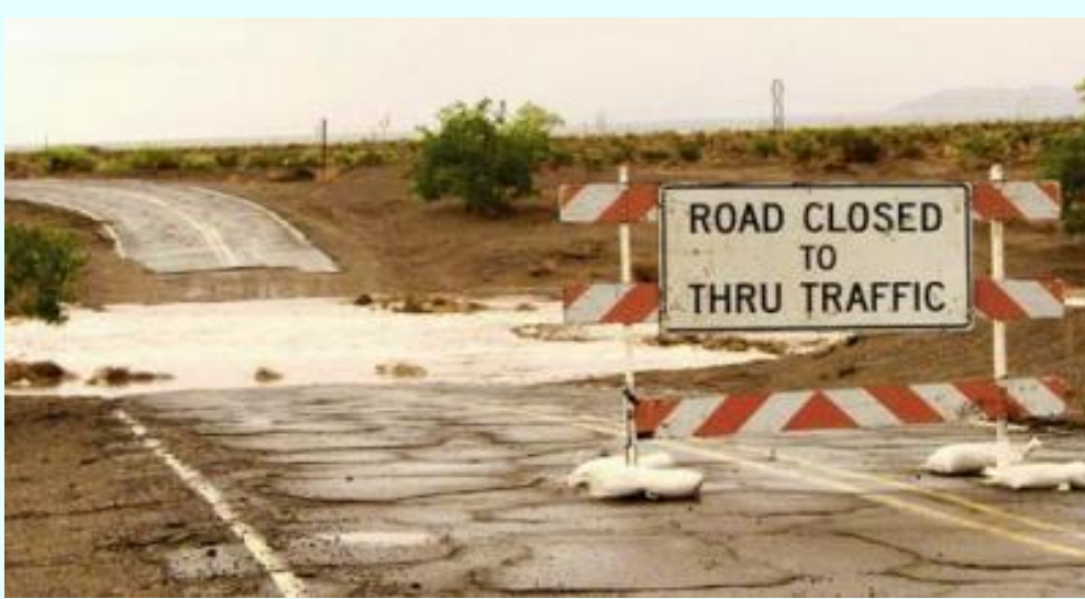
Heavy rains on July 10 flood portions of Luna County near Deming.