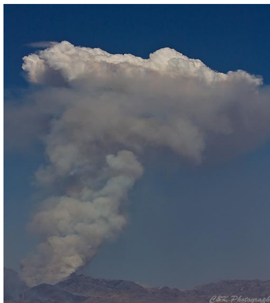
Dry late winter and spring conditions contributed to this wild fire over the Organ Mountains east of Las Cruces.