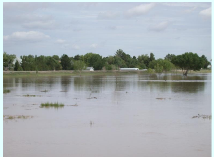
Heavy rains in July force the Rio Grande to overflow over west El Paso.