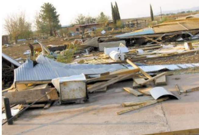
Severe thunderstorms with wind gusts near 80 mph destroy this trailer at Tularosa NM on May 28, 2008.

May 20: Hot day across southern New Mexico and western Texas including El Paso which ties a record by reaching 100 degrees.