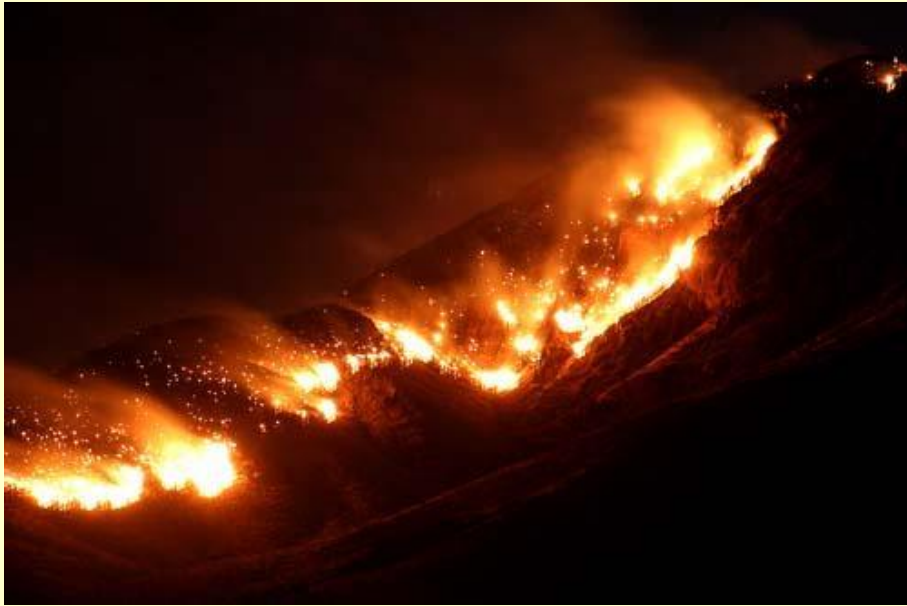
A large wild fire burns over the Organ Mountains east of Las Cruces around Dripping springs on June 14 2008.

June 28: Damaging thunderstorm winds destroy a marina at Elephant Butte Reservoir in Sierra County.