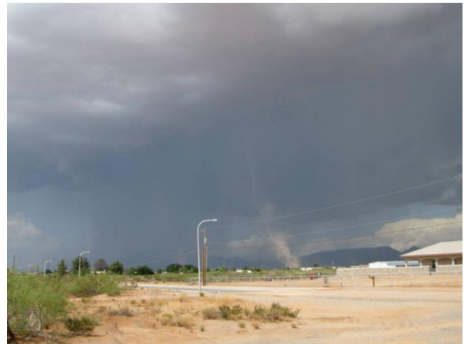
Small tornado touches down near Las Cruces on July 30.

July 29: Almost 3 inches of rain fall near Lordsburg.