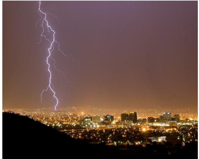
Lightning over El Paso on August 3.

September 14: Evening thunderstorms cause flash flooding over portions of Horizon City TX with one home flooded.