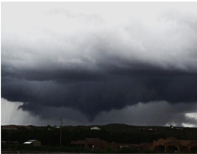
Funnel cloud near Las Cruces associated with rain band from Hurricane Dolly. (Jesse Christofano)