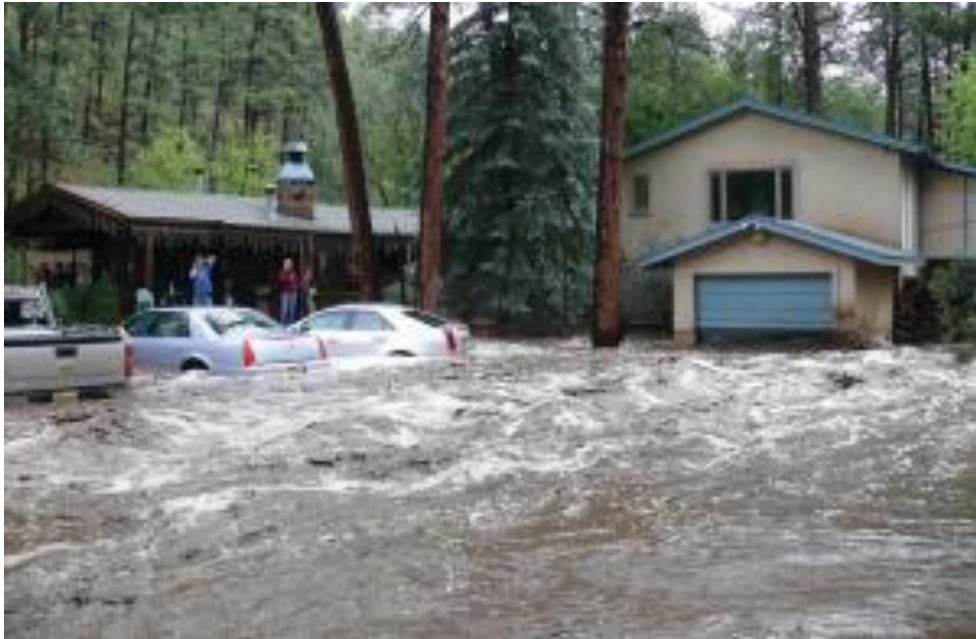
Remnants of Hurricane Dolly bring extensive flooding to Ruidoso NM.