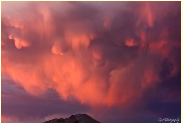
Storm clouds near Las Cruces on July 7.

July 9: Heavy rains and flooding pound southern New Mexico and western Texas once again. In Sierra County up to 3 inches of rain fall and a 7 foot wall of water gushes down Ash Canyon causing mudslides and washing out Highway 51. High waters also wash out a bridge and close Highway 195. In Dona Ana County heavy rains flood roads around Hatch and Luna. Flooding also occurs near Columbus. More heavy rains create problems for the El Paso metro area with the Rio Grande overflowing over west El Paso and Sunland Park NM. In the Sacramento Mountains 6 inches of rain fall near Weed flooding a ranch.