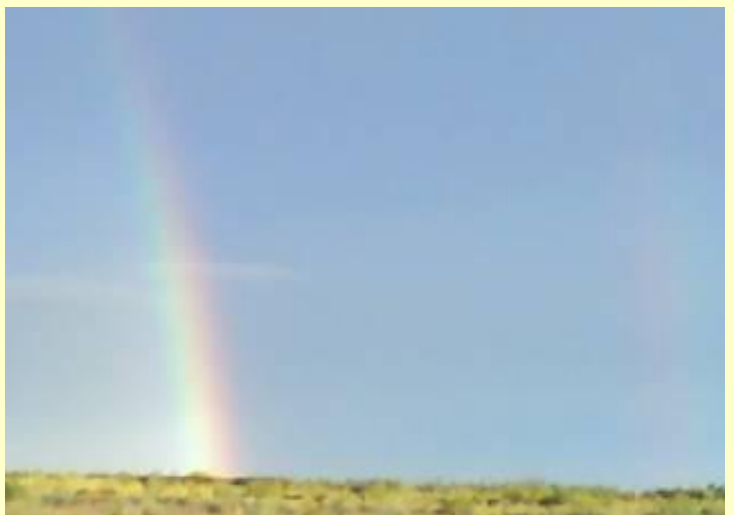
Rainbow near west El Paso on July 8.