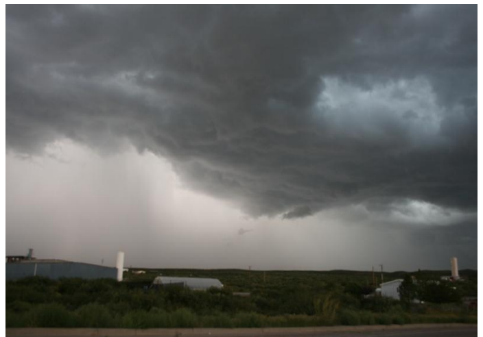
Strong thunderstorms strike the Las Cruces area on September 7. (Jeff Passner)