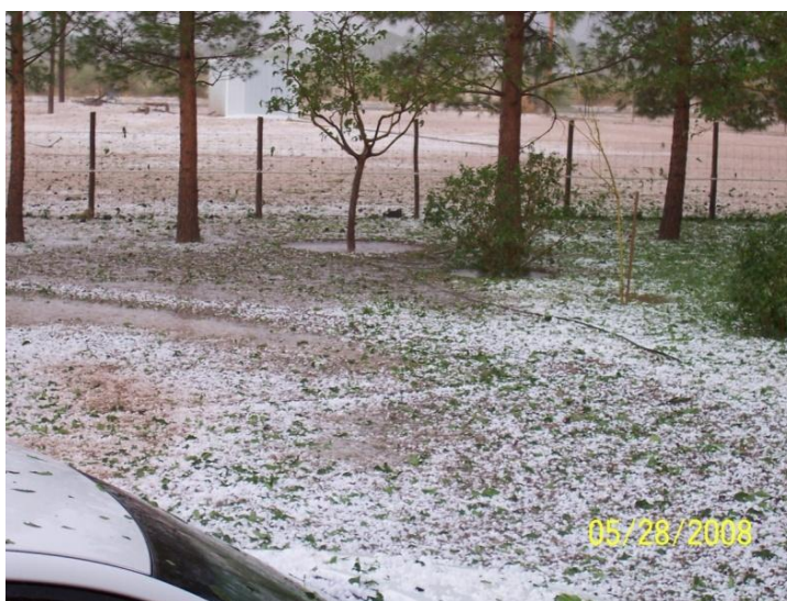
May 28 severe thunderstorms bring large hail which damage homes around Tularosa.