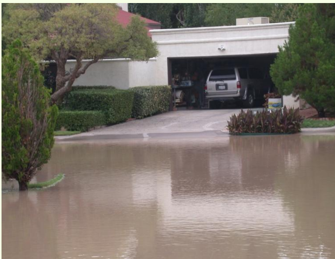
Heavy rains from Hurricane Dolly flood portions of west El Paso.

Dolly then moves to the north bringing more heavy rains to the Sacramento Mountain area. Ruidoso receives over 6 inches of rain which drown one person as rivers and creeks overflow and bring extensive and destructive flooding to the town. Around Mescalero numerous roads and several buildings flood as two dams fail at Mud Canyon. Further west heavy rains and high waters close streets over Grant County around Silver City and northern Sierra County near Monticello.