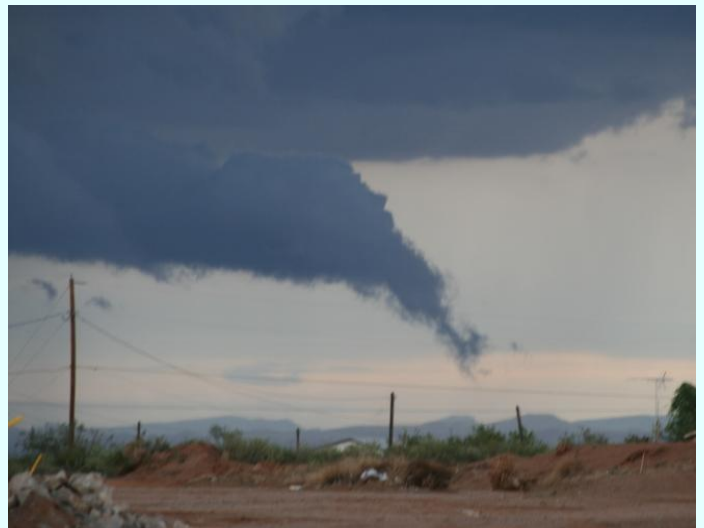
Funnel cloud near Las Cruces on July 13. (Jeff Passner)

July 19: Over an inch of rain falls in 20 minutes over El Paso with portions of a road washed away.