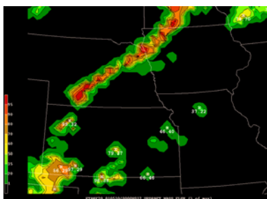
(b) Predicted hourly maximum parameterized updraft mass flux, a unique field produced in experimental model forecasts at NSSL and SPC