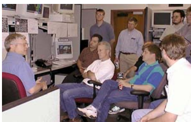
An SPC forecaster shares his perspective at an NSSL/SPC map discussion.