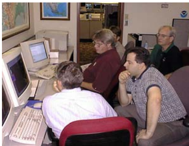
The forecast team evaluates numerical model output during simulated operational forecasting exercises in the 2001 NSSL/SPC Spring Program.