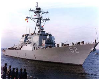
Phased array radar is currently used on Navy ships to support tactical operations.