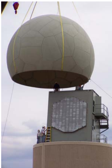
Installation of the SPY-1A antenna and radome on the NWRT

Phased array radar technology may help forecasters of the future provide earlier warnings for tornadoes and other types of severe and hazardous weather. Researchers are adapting the SPY-1 radar technology, developed by Lockheed Martin to support tactical operations aboard Navy ships, to weather detection. The phased array radar project has begun a new stage in NSSL's leadership in the research and development of future generations of weather radar.