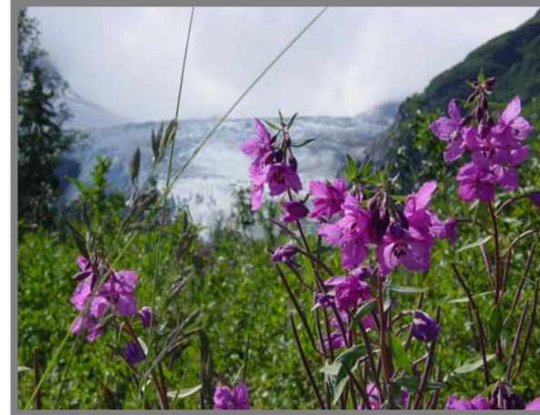
Worthington Glacier, AK