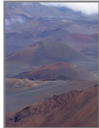
Haleakala NP, Maui