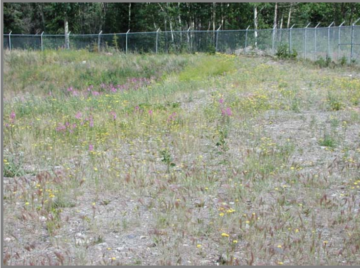
Narrowleaf hawksbeard infestation in Denali N.P. before (yellow flowers)...

Controlling source populations of exotic plants is of particular importance in Alaska, where it may still be possible to prevent widespread invasion.