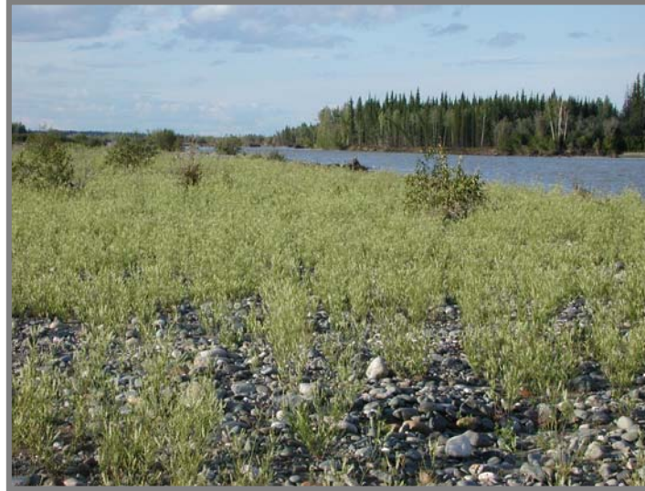
White sweetclover on Nenana River bar