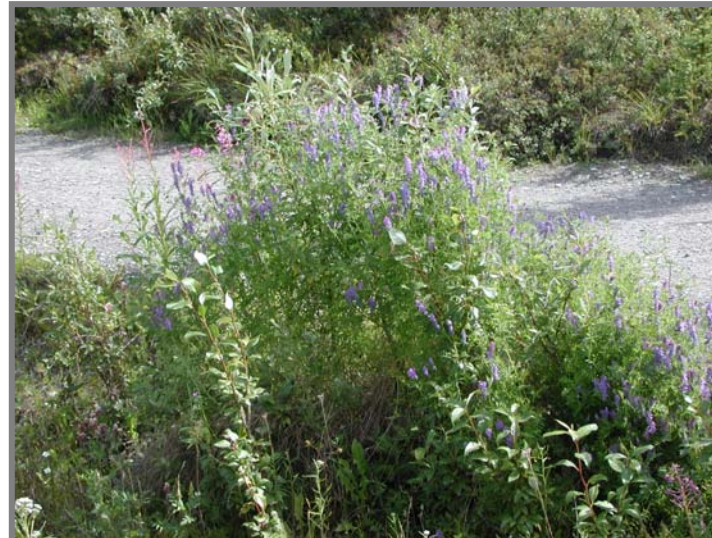
Bird vetch in Denali National Park (purple flowers)