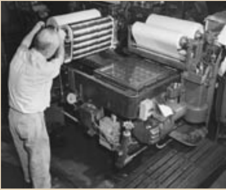
Flatbed power press, 1949–1953