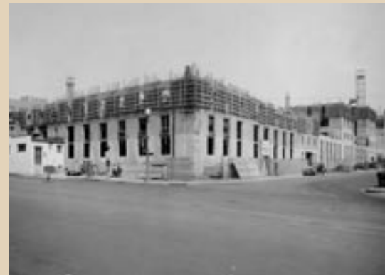
Bureau of Engraving and Printing, annex building entrance