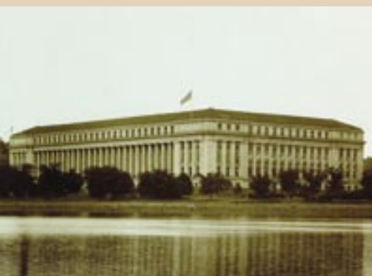
Bureau of Engraving and Printing, 1880 building