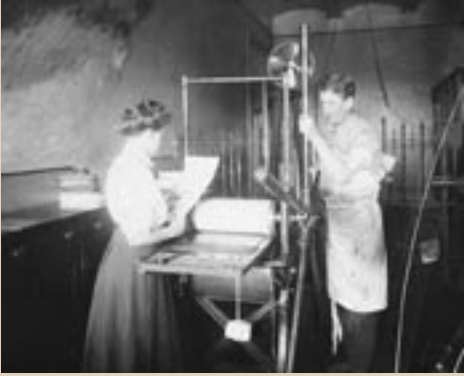
Spider press with plate printer and printer's assistant, 1902–1914