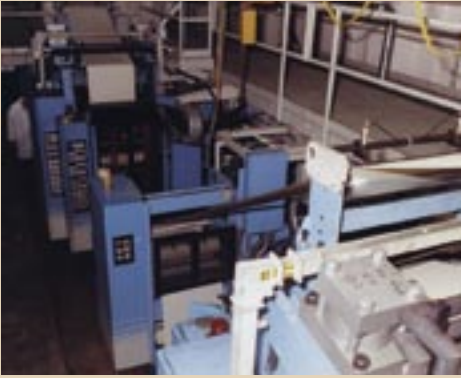
Web currency press, 1990–1995