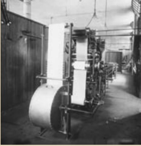
Stickney press, 1912–1914