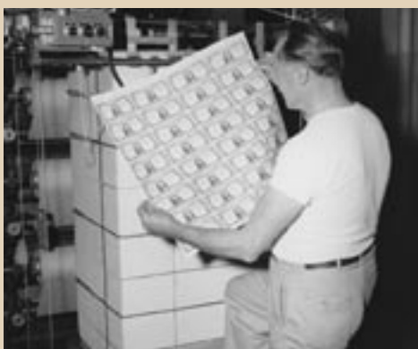
Engraving Division, 1915