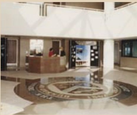
Western Currency Facility, under construction, late 1980s