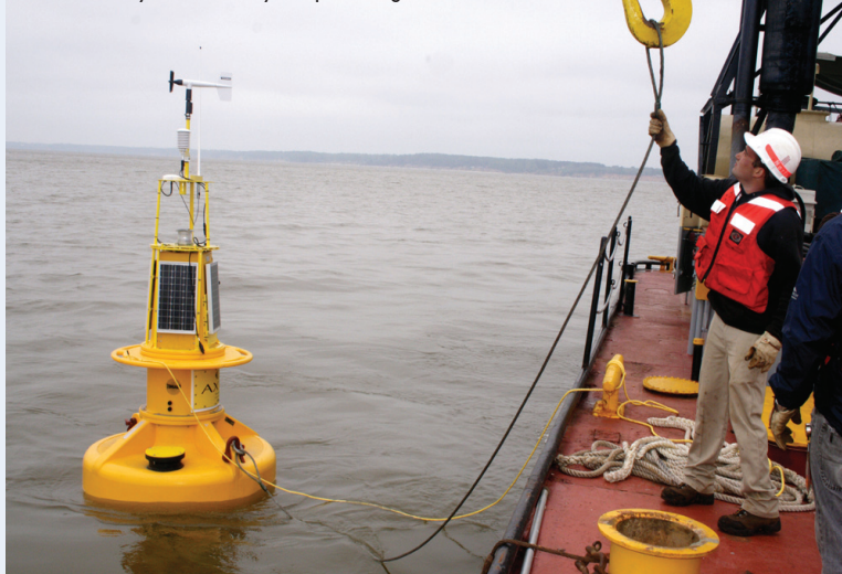
▲ Buoy in the Captain John Smith Chesapeake Water Trail being deployed off shore from a statue of its namesake in Jamestown, Virginia.