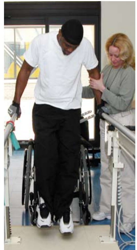
Polytrauma care at the Tampa VA.