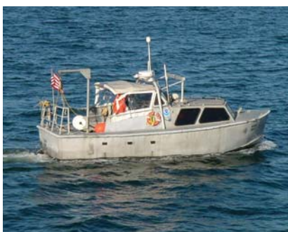
One of the ship's survey launches conducts survey operations.