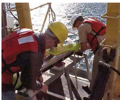
Deck crew lowers side-scan sonar "fish"

Length: 208 ft. Breadth: 45 ft. Draft: 14 ft. Displacement: 2054 tons Cruising Speed: 12 knots Range: 19,200 nm Endurance: 80 days Hull Number: S222 Call Letters: WTEA Commissioned Officers: 8 Licensed Engineers: 4 Crew: 19 Launched: February 14, 1991 Delivered: January 10, 1992 Transferred to NOAA: March 3, 2003 Commissioned: July 8, 2003 Builder: Halter Marine, Inc. Designer: Halter Marine, Inc., Moss Point, Miss.