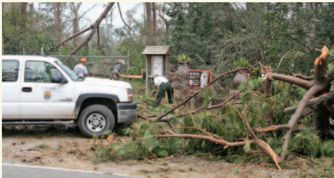
Hurricane Katrina initially closed 16 national wildlife refuges. Five refuges were still closed in early October. Damage estimates to U.S. Fish and Wildlife Service lands and facilities topped $225 million from Hurricanes Katrina and Rita, although assessment was continuing in early October.

Even in the face of personal loss, Service employees brought their expertise to aid communities devastated by the unprecedented storms. More than 600 Service employees were assigned to the damaged areas over the course of a month. Initial reports made clear the dramatic nature of the disaster: cell and satellite phones were not reliable, the need for ice was a major concern, all personnel had to be self-sufficient. One FWS Special Agent helped clean up a school in Lake Charles, Louisiana; another