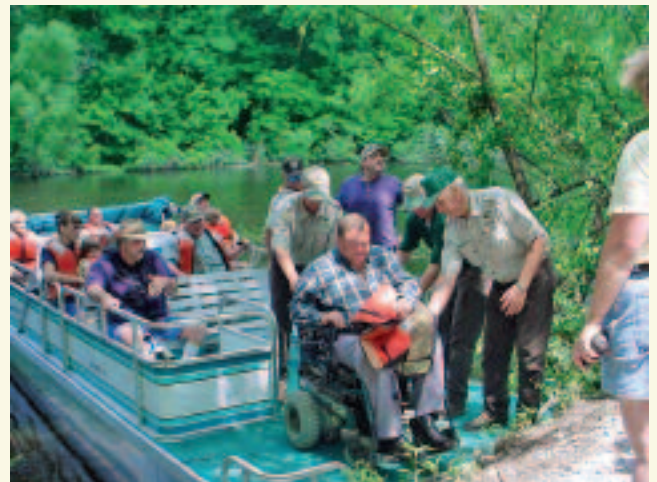
Boat rides were among the most popular activities at Step Outside Day at the Sherburne Refuge Complex in Louisiana. Activities were tailored for people with physical or mental disabilities.

painting, target and bow shooting, water safety displays and live animals. Local businesses supplied volunteers, Lowes hosted a wood kit assembly tent, and Bluebonnet Swamp Nature Center brought animals for kids to touch. About a third of the participants were mentally or physically challenged. Plans are already underway for a 3rd Annual Step Outside Day next summer.