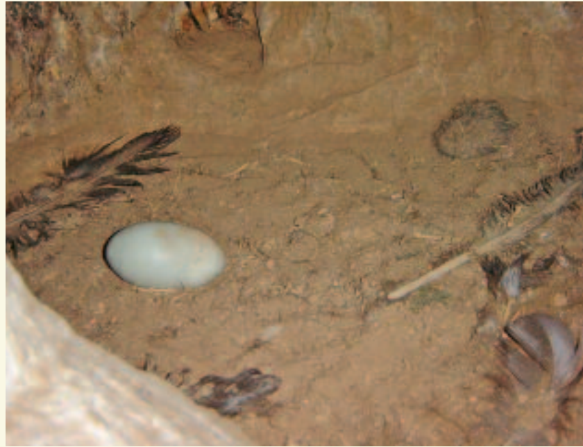
A five-hour race to the airport and a harrowing climb up a mountain cliff enabled a pair of wild California condors, who had been faithfully sitting on an infertile or otherwise bad egg for the full 57-day incubation, to welcome a wild-born chick that resulted from a successful egg switch, only the second time such a procedure has been undertaken.

Last year, California saw its first condor chick to fledge in the wild in 22 years.