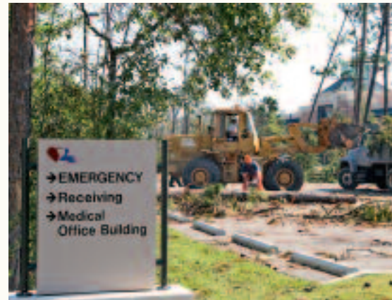
Even in the face of personal loss, Service employees brought their expertise to aid communities devastated by the unprecedented storms. More than 200 Service employees were assigned to the damaged areas, clearing debris and opening the road to the Louisiana Heart Hospital.

Many have characterized Hurricane Katrina as being a storm of Biblical proportions. One tiny house in storm-ravaged Bay St. Louis became a Noah's ark.