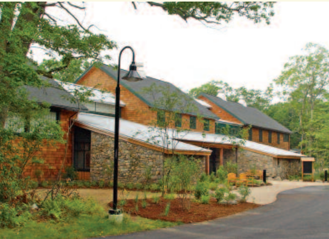
Red cedar shingles and local stone add texture to tradition in the new, energy efficient Rhode Island NWR Headquarters.