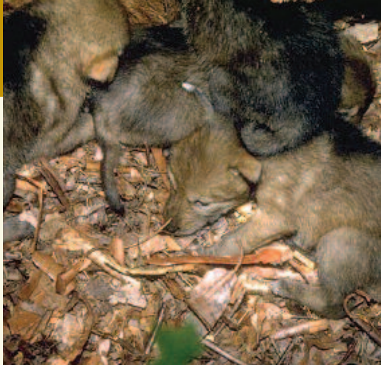
Biologists on St. Vincent NWF, FL, found evidence in June of the first wild-born litter of red wolf pups since 1998.

Her current mate arrived from the North Carolina Zoo in November 2004 and was released into the wild in January 2005 after he acclimated. The pair quickly joined one another and have acted like pair-bonded animals ever since. ♦