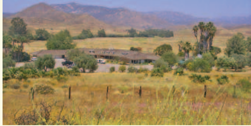
Through land acquisition, species management programs, captive propagation of listed species, control of invasive species and particularly habitat enhancement and restoration, the ability of San Diego Refuges to sustain life is being greatly enhanced. Habitat restoration plays the most critical role.

In addition to other things, the policy provides refuge managers with a process to analyze the needs of individual refuges and then recommend the best management direction to prevent further degradation of environmental conditions. Where appropriate and in concert with refuge purposes and Refuge System mission, refuge managers can restore lost or severely degraded components.