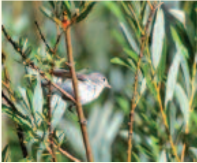
Least Bell's vireos have been extirpated from California's Central Valley for perhaps a half century.