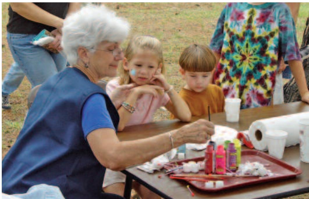
National wildlife refuges generated almost $1.4 billion for the national economy in 2004. (USFWS)

The National Wildlife Refuge System is a significant economic engine even while it conserves and enhances wildlife habitat and wildlife and offers some of the nation's most alluring recreation opportunities. The nearly 37 million people who visited national wildlife refuges in fiscal year 2004 generated almost $1.4 billion in total economic activity related to refuge recreational use, according to Banking on Nature 2004: The Economic Benefits to Local Communities of National Wildlife Refuge Visitation , released October 6 by Secretary of the Interior Gale Norton.