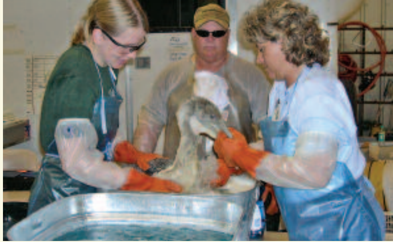
A deadly oil spill in June killed 656 baby pelicans at Breton NWR in Louisiana. Each of the surviving pelicans had to be individually washed with dishwashing soap, rinsed and dried before being taken to a pen with drying lamps.