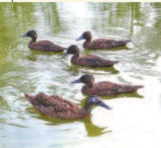
Female Laysan ducks transferred to Midway Atoll NWR have produced nests with five to 10 eggs, almost double the average clutch size – possibly due to abundant food sources in the newly restored habitat.

Laysan ducks brought to Midway Atoll NWR are not only thriving but reproducing in their first year at their new home. The ducks are one of only two endemic duck species still found in Hawaii; the other is the Hawaiian duck, or koloa. Fearing that a single event like a typhoon could wipe out the species, biologists in October 2004 transferred 20 ducks from Laysan Island in the Hawaiian Islands NWR to Midway Atoll, about 1,250 miles northwest of Honolulu. Since then, only one duck died, and that because of an aggressive albatross that attacked one of the new arrivals. A second translocation of 32 birds to Midway's Eastern Island is planned for October. Five of the six original females nested; by the time Refuge Update went to press, nine or 10 ducklings had survived for at least a month. At least two of the females are re-nesting. "If survivorship and reproduction continue at current levels," said Refuge Biologist John Kalvitter, "we someday hope to have a population at Midway that compares to Laysan Island."