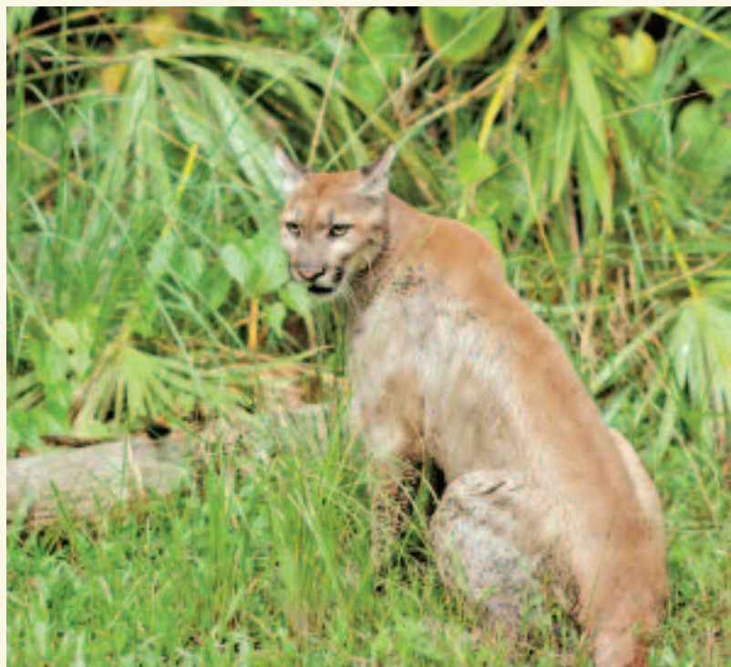
Florida Panther NWR has been closed to the public since it was established in 1989. As many as five to 11 panthers each month use a portion of the refuge for hunting, traveling to other areas, loafing or denning. Because Florida panthers are such elusive animals, visitors have little chance of encountering one on the trail system, although Jane's Scenic Drive traverses panther habitat and is open to the public.

The 26,400-acre Florida Panther Refuge is in the heart of southwest Florida's Big Cypress Basin. It encompasses the northern origin of the Fakahatchee Strand, the largest cypress strand in the Big Cypress Swamp. About 125 bird species, including wood storks and swallow-tailed kites, are found on the refuge. ♦