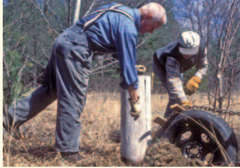
Volunteers removed parts of a former military obstacle course from the interior of Assabet River NWR for its official dedication in October. Assabet Refuge was a Superfund clean-up site before becoming part of the Refuge System, and much of the refuge is still closed to the public because of physical safety hazards.