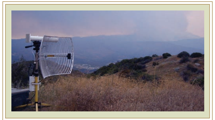
HPWREN, a high performance wireless research network, expands the reach of cyberinfrastructure into remote environments in and surrounding San Diego County to support a range of science, engineering, education, and emergency response initiatives.

will also support projects that study how ongoing and future cyberinfrastructure efforts might be informed by lessons learned and by the identification of promising practices. Among other things, NSF seeks to build a stronger foundation in our understanding of how individuals, teams and communities most effectively interact with cyberinfrastructure; how to design the critical governance and management structures for the new types of organizations arising; and, how to improve the allocation of Cyberinfrastructure resources and design incentives for its optimal use. These types of activities will be essential to the agency's overall success. NSF will support studies of the evolution and impact of cyberinfrastructure on the culture and conduct of research and education within and across different research and education communities. It will also encourage systemic design of virtual organizations with embedded evaluation to better address the complex interaction of technological and social issues with the user community.