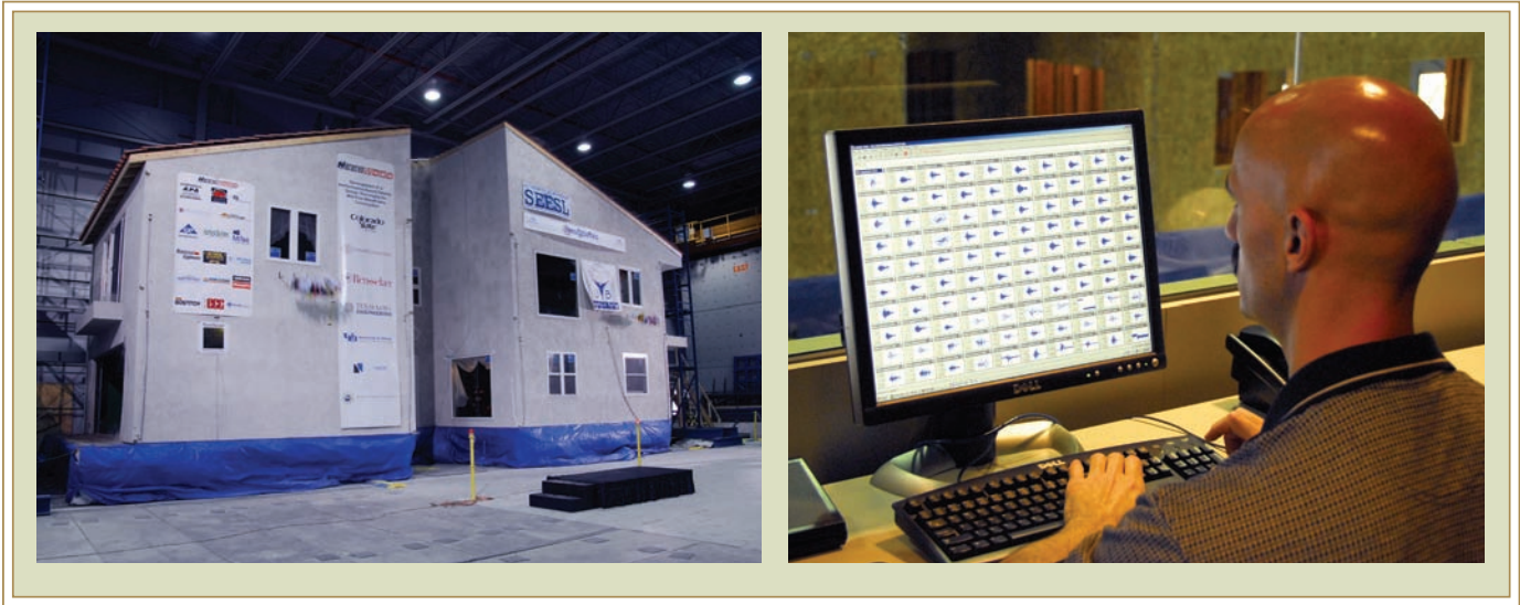
The NEES@buffalo shake table recreates movements of the forces generated by an actual earthquake. NEES allows earthquake engineers and students located at different institutions to share resources, collaborate on testing, and exploit new computational technologies.

reliable, accessible, usable, pervasive, persistent and interoperable, and that are able to exploit the full range of research and education tools available at any given time.