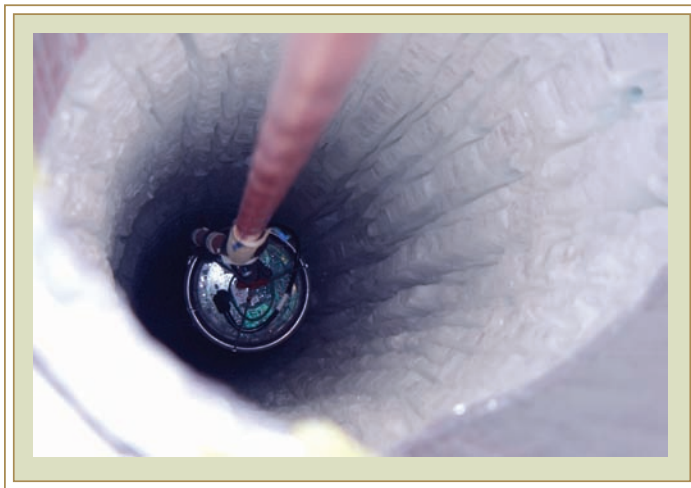
A digital optical module is lowered into a hole over 1,450 meters deep in the ice at South Pole station. These sensors are deployed as part of the IceCube international collaboration to further understanding of the Universe by finding evidence of high energy subatomic particles.

The cyberinfrastructure framework developed will integrate widely accessible, common cyberinfrastructure resources, services, and tools, such as those described in other chapters in this document, enabling individuals, groups and communities to efficiently design, develop, deploy, and operate flexible, customizable networked resources and VOs to advance science and engineering.