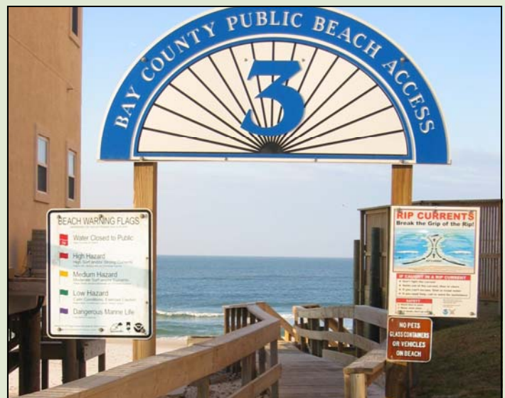
A beach access site in Florida also provides educational signage about rip currents and a safety warning flag system.