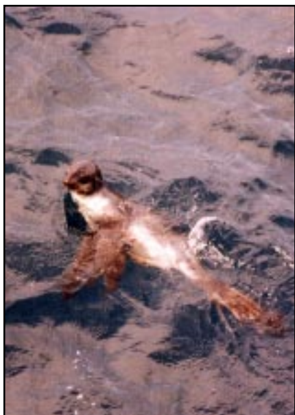
A young Guadalupe fur seal swims 60 miles offshore above the Davidson Seamount.

Those in NOAA who have been on a long cruise can appreciate that you suddenly have time for in-depth conversations. You have time to learn how a colleague fell into their career. You listen to radio because there's no television. You share metaphors. Your shipmates become friends. ☺