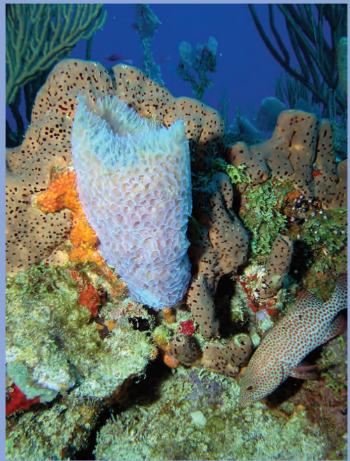
US coral reefs are found in the Atlantic, Caribbean and throughout the Pacific. Their annual economic worth is more than US $250 billion.

The Institutes provide a direct link between researchers and resource managers, providing information for managers to make sound policy and decisions. They build capacity through equipment procurement, graduate and undergraduate training, sponsoring workshops and symposia, and research collaborations. By concentrating on important and unique management and policy challenges, scientific contributions are made that better allow decisions on both local and national scales.