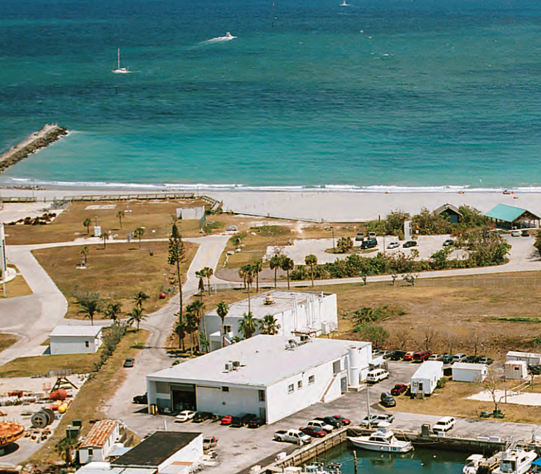
The NCRI facility at Nova Southeastern University in Ft. Lauderdale, Fla.

The objective of the National Coral Reef Institute (NCRI) is the protection and preservation of coral reefs through basic and applied research on coral reef assessment, monitoring, restoration, and biodiversity, coupled with education and training of scientists, managers, and educators. NCRI focuses on US coral reefs worldwide and within Florida reef systems.