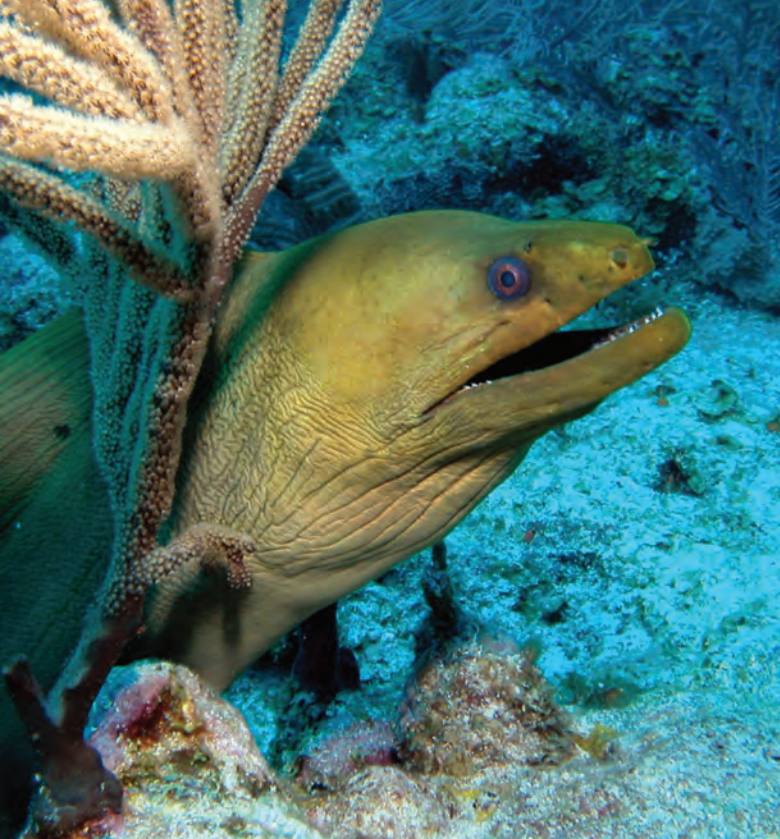
A green moray eel makes its home in coral crevices, which provide a good hiding place to ambush prey.