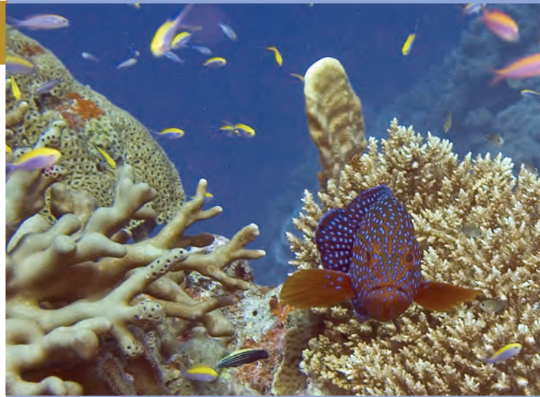
Coral reefs have been called the “rainforest of the sea” because they are home to a large number of marine species.

The CRCP is a multi-office program that uses the diverse expertise across NOAA to help protect important coral reef ecosystems. NOAA's Center for Sponsored Coastal Ocean Research (CSCOR) is a partner in the CRCP and administers the Institutes. It is the CSCOR mission to lead the development of predictive multidisciplinary coastal ecosystem research that explains and predicts the impacts of natural and anthropogenic influences on coastal regional ecosystems, communities, and economies and allows for informed actions.