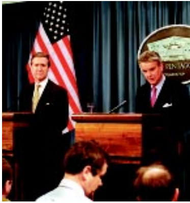
French Minister of Defense Alain Richard responds to a question during a joint press briefing with Secretary Cohen.

Should this remain true indefinitely? The EU, after all, represents a powerful economic force and increasingly seeks to take joint action in foreign and security affairs. The United States, for its part, has neither the desire nor the capability to engage its military in every crisis response or humanitarian relief contingency that might arise anywhere in the world. It is in our mutual interest, therefore, to find better ways for the American and European pillars of the transatlantic community to work together to strengthen security and stability in regions outside Europe.