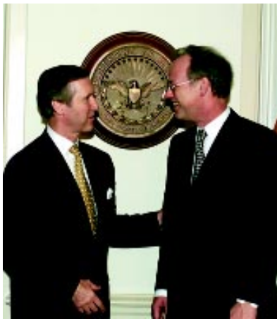
Secretary Cohen welcomes German Minister of Defense Rudolf Scharping to the Pentagon.

Complementing our engagement through NATO and other fora, the United States advances its shape, respond, and prepare objectives through diverse multilateral and bilateral security relations with Allies and Partners.