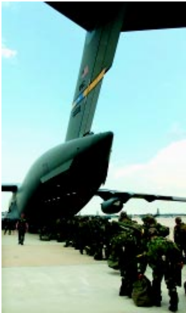
Paratroopers from the U.S. Army’s 82nd Airborne and the Ukraine Department of Air Mobility line up to load into a C-17 Globemaster III at Fort Bragg preparing to jump in support of Peaceshield 2000.