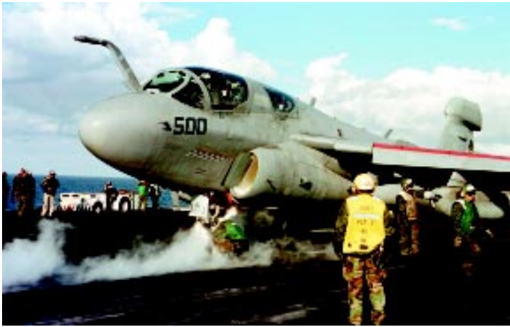
An EA-6B Prowler is prepared for launch off the USS Enterprise in the Adriatic Sea.

and an Alliance-wide consensus for action simply does not exist. We will do what we must to defend these interests, including, when necessary, using our military might unilaterally. In practice, however, this has occurred very rarely. We see a broad and growing spectrum of issues that are important to our security and where close cooperation with our Allies and Partners is a requirement—not an option. While some foreign policy commentators on both sides of the Atlantic seem quick to level charges of American “unilateralist” or “isolationist” tendencies, the facts almost never support such claims—and we should not be reluctant to point this out.