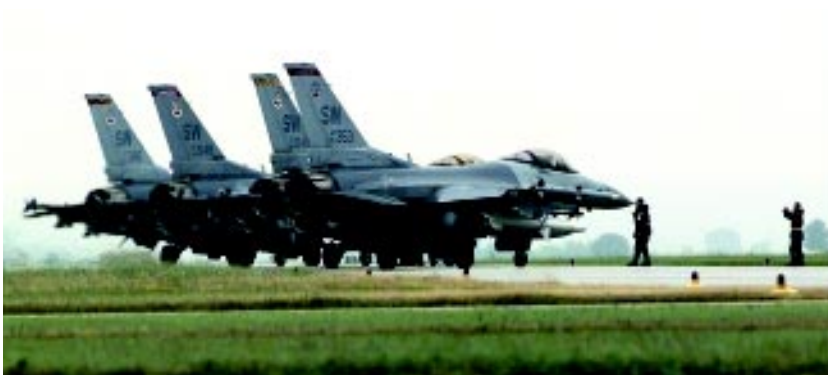
Four U.S. Air Force F-16 Fighting Falcons line up at the end of the runway at Aviano Air Base, Italy, for final checks before taking off on NATO Operation Allied Force missions in May 1999.

■ To ensure transatlantic security in the future, the United States and its Allies must improve defense capabilities in the fields most relevant to modern warfare. Operation Allied Force reinforced the fact that we need more deployable, sustainable, interoperable and flexible forces to engage effectively in a wide variety of situations. The United States is already moving to address these requirements, and we look to the rest of NATO to do its share. This effort will not be cost-free. All Allies have the responsibility to match their rhetoric with real resources. In many cases this will require increased defense budgets as well as smarter spending and pooling of resources.