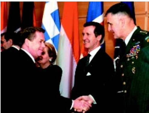
President Vaclav Havel of the Czech Republic is greeted as a new member of NATO by Secretary Cohen and the Chairman of the Joint Chiefs of Staff, General Henry H. Shelton (right).

Enlargement is not a new concept for NATO. Since its creation in 1949, the Alliance has grown from 12 to 19 members in four rounds of enlargement, adding Greece and Turkey in 1952, the Federal Republic of Germany in 1955, Spain in 1982, and the Czech Republic, Hungary, and Poland in 1999. Moreover, as NATO's leaders declared at the Washington Summit: "The three new members will not be the last." In fact, the record demonstrates that with every new member, NATO has become stronger, and European stability has been enhanced.