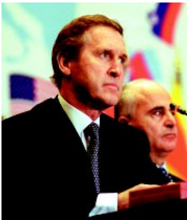
Secretary Cohen listens to his defense counterparts at the Southeastern Europe Defense Ministerial in Thessaloniki, Greece in October 2000.

A leading symbol of SEDM's contribution to regional security is the Multinational Peace Force Southeastern Europe (MPFSEE). 10 The MPFSEE will be capable of fielding up to a brigade-level multilateral force for employment in regional conflict prevention and peace support operations. Its force structure, command and control, training, information and logistical structures will be broadly compatible with those of NATO. In addition, the MPFSEE will draw upon capabilities being developed under SEDM to mount regionally based responses to humanitarian crises, natural disasters (e.g., earthquakes), or other emergency contingencies. Examples of these capabilities are: the Crisis Information Network, a computer-based system that allows the SEDM countries to exchange planning data and coordinate multilateral emergency relief efforts; and the Engineer Task Force, on-call units of military engineers able to perform road, bridge, and rail repairs and conduct limited de-mining and unexploded ordnance clearing operations. The SEDM's "can do" spirit exemplifies what the United States and its Allies want to encourage across the board—a growing pattern of cooperation on practical problem-solving and security-building steps that emanate from within Southeastern Europe.