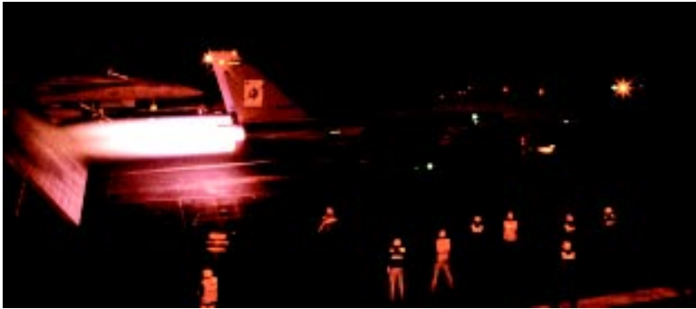
A U.S. Navy F-14 Tomcat goes to full afterburner as it prepares to launch.

facilitate efforts by potential adversaries—both hostile states and increasingly sophisticated terrorists—to develop or acquire nuclear, biological, and chemical (NBC) weapons and the means to deliver them. Humanitarian disasters beyond Europe can have an important impact on transatlantic interest and require joint U.S.–European responses.