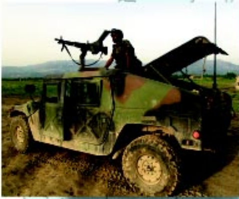
An Air Force security specialist watches the perimeter at Rinas Airport in Tirane, Albania during NATO Operation Allied Force. Air Force personnel provided airfield security for incoming aircraft and personnel deployed to the airport in support of Task Force Hawk and Joint Task Force Shining Hope.