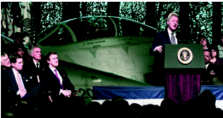
President Clinton thanks personnel deployed overseas in support of U.S. and NATO operations.

In the Euro-Atlantic region, we pursue our shape, respond, and prepare strategy through three mutually reinforcing layers of engagement centered on NATO, multilateral engagement with countries participating in NATO's Partnership for Peace (PfP) and members of the EU, and bilateral engagement with individual Allies and Partners. Within each layer of engagement, U.S. military forces stationed in Europe play a key role in advancing our security objectives.