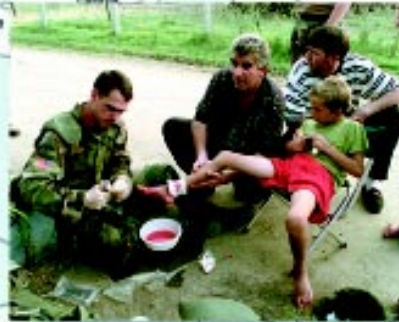
A soldier deployed to Kosovo as part of KFOR works to sterilize and bandage a dog bite on a young boy's leg in the town of Vitina Kosovo.