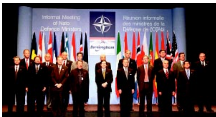
Meeting of NATO Defense Ministers at Birmingham, UK, October 2000.

regional conflicts on the periphery of NATO, proliferation of NBC weapons, and terrorist attack) have increased significantly. These emerging threats are further complicated by the fact that they could emanate from a variety of sources, in combination or alone, and at any time. In response, NATO forces and structures have begun to change in important ways, and NATO Allies have agreed that the Alliance will need new capabilities applicable to both Article 5 and non-Article 5 contingencies.