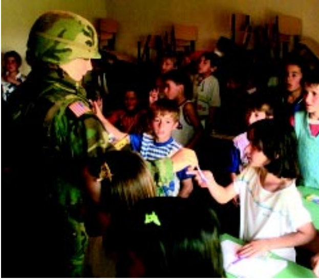
North Dakota Army National Guard soldier hands out pens and pencils to students in a schoolhouse in Kosovo.

efforts to complement military power through the application of more robust economic and political mechanisms. In addition, because the military aspects of intervention do not end when the shooting stops, our security approach to the region must also focus on further enhancing the ability of NATO Allies and Partners to assist with political rebuilding and the normalization of civil society and other functions.