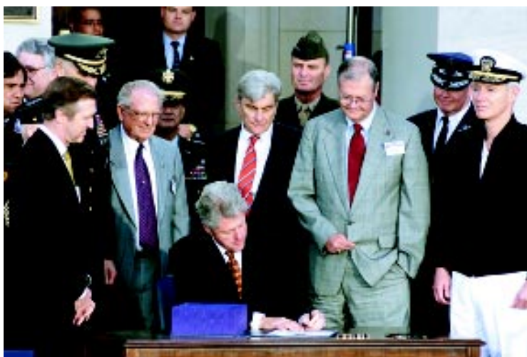
Defense officials and members of Congress surround President Clinton as he signs the National Defense Authorization Act FY 2000.

A second explanation is less self-evident: in far too many instances, the substance of our transatlantic cooperation is overshadowed or even impeded by differences in tone . Americans, for example, frequently refer to their “leadership” of the Alliance. For many Americans, this concept is essentially an accurate reflection of objective facts—in particular, the real disparities in military capabilities between the United States and