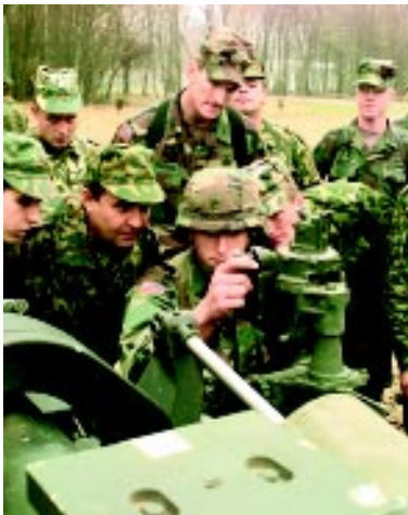
U.S. Army soldier explains the M-137A1 Panoramic Telescope to members of the Russian Separate Airborne Brigade at Camp Eagle, Bosnia.

While we strive to reach a common understanding with Russia, we must also underscore that it is in Russia's own national interest to broaden security-related cooperation with the United States, NATO and Partners. Here, as well, we have an excellent foundation upon which to build. For example, under the Expanded Threat Reduction Initiative, the United States is enhancing and enlarging existing programs that over the past eight years have helped the Russians to: deactivate thousands of nuclear warheads; destroy hundreds of missiles, bombers and ballistic missile submarines; improve security of nuclear weapons and materials at dozens of sites; prevent the proliferation of biological weapons and associated capabilities; begin safe destruction of the world's largest stocks of chemical weapons; and provide opportunities and inducements for thousands of former Soviet weapons scientists to participate in peaceful commercial and research activities. Several NATO and EU countries are engaged in related bilateral and multilateral efforts to assist Russia in dealing with the WMD-related legacy of the former Soviet Union.