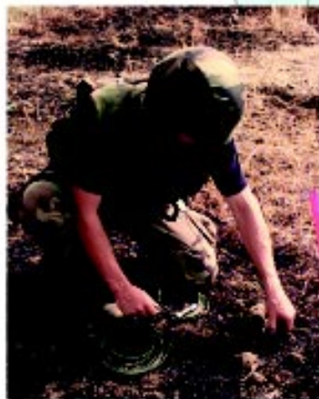
While on a peacekeeping mission in Kosovo, an Air Force service member prepares an unexploded BLU-97 bomb for demolition in a field outside of Urosevac, Kosovo.