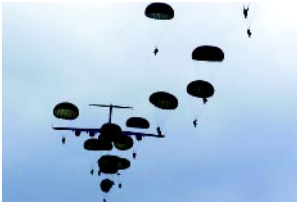
Paratroopers from the U.S. Army's 82nd Airborne and the Ukraine's 80th Air Mobile parachute from a C-17 Globemaster III.

improved training for border security and customs personnel and assistance to redirect the expertise of Ukrainian weapon scientists to work on peaceful scientific and engineering projects, such as improved safety and security for civilian nuclear installations and managing the environmental and health consequences of the Chernobyl disaster.