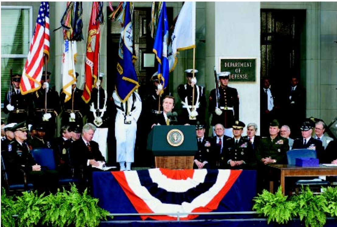
Secretary Cohen introduces President Bill Clinton at the Pentagon as he prepares to sign the National Defense Authorization Act FY 2000, which provides for the first sustained increase in defense spending in 15 years.