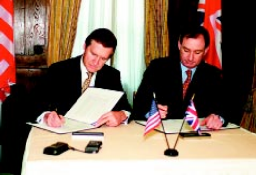
Secretary Cohen and British Secretary of State for Defense Geoffrey Hoon sign a Declaration of Principles for Defense Equipment and Industrial Cooperation in February 2000.

has only just begun, and we realize it will take time to complete. NATO can and should be flexible and generous in establishing such a relationship. Equally, the EU—a strong, confident, and vibrant institution that has accomplished so much in bringing Europeans toward an “ever closer union” in so many areas—can and should be flexible and generous in its approach.