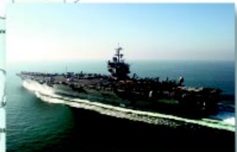
The aircraft carrier USS Enterprise (CVN 65) steams to the southern end of its operating area in the Persian Gulf the morning of the first wave of air strikes on Iraqi targets in support of Operation Desert Fox.

■ Area of Responsibility ■ Area of Interest