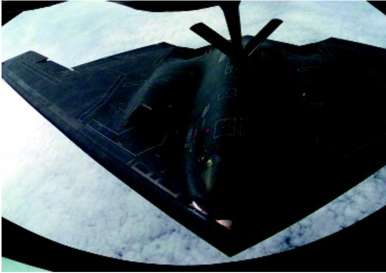
A B-2 Spirit refuels from a KC-135 Stratotanker during an air strike mission in support of NATO Operation Allied Force.

Kosovo once Serbian President Slobodan Milosevic agreed to NATO's terms to end the conflict.