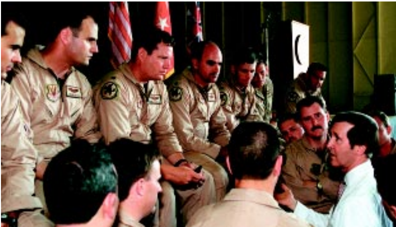
Secretary Cohen talks with U.S. Air Force F-16 Fighting Falcon pilots of the 120th Fighter Squadron.

We are therefore working with Allies and Partners to institutionalize democratic reforms in Central and Eastern Europe, and to integrate the states of that region into Euro-Atlantic structures. Such reforms can help avert or resolve problems that, if left unchecked, may lead to ethnic conflict and regional violence,