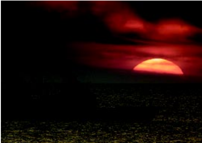
USS Normandy steams in the Atlantic while operating with the USS George Washington battle group.

To address the NBC weapons threat, the United States pursues a multi-dimensional strategy. Each component of our strategy depends, to varying degrees, on close cooperation with our transatlantic Allies and Partners, backed up by active bilateral and multilateral diplomatic efforts. For example: