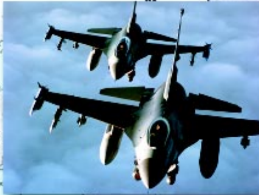
Two U.S. Air Force Fighting Falcons fly in formation during a mission in support of NATO Operation Allied Force.