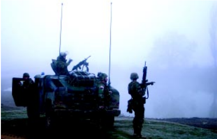
65th Military Police Company secures road from Stublina, Kosovo during the Operation Joint Guardian peacekeeping mission.

of mass destruction (WMD). There is no better way to shape a stable security environment and prevent new lines of division or confrontation in Europe than to reach out to Central and Eastern European states anxious to be integrated fully into the political, economic, and security structures of the transatlantic community. For the same reason, we need to build increasingly positive relations with the Russian Federation, Ukraine, and the other independent and distinctive states that emerged from the former Soviet Union.