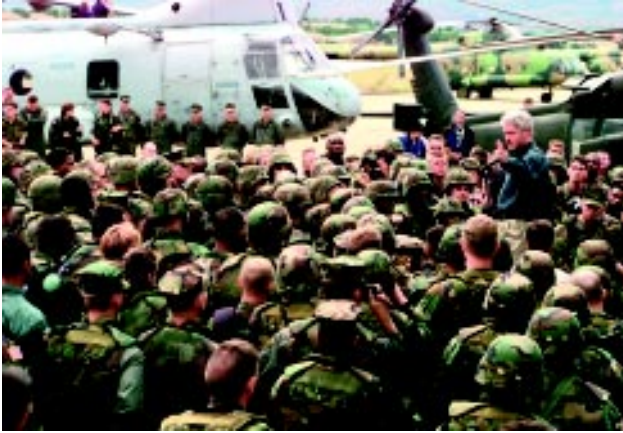
President Bill Clinton speaks to Allied and Partner troops deployed to Skopje, Macedonia in June 1999.

Operational Capabilities Concept (OCC) . The OCC aims to improve the military capabilities and interoperability of Partner forces that are slated to participate in NATO-led PfP operations. The OCC will also enable NATO in future SFOR or KFOR-like scenarios to put together tailor-made force packages, which may include Partners, for mounting and sustaining such operations. The OCC provides for enhanced “peacetime working relationships” between Alliance and Partner forces and will help Partners enjoy a greater voice in PfP decision-making.