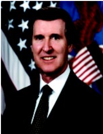
Secretary of Defense William S. Cohen

Our strategy to preserve the security and stability of the transatlantic community in the future is based on certain overarching principles and realities: