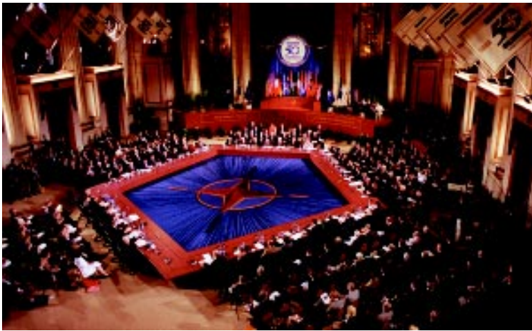
The North Atlantic Council convenes in Washington, D.C. on April 24, 1999 during the 50th Anniversary NATO Summit.

Further intra-Alliance consultations based on the idea proposed by Secretary Cohen resulted in the Defense Capabilities Initiative (DCI), which was launched by President Clinton and other Allied leaders at the Washington Summit. Specifically, Allies agreed to improve capabilities in five functional areas: