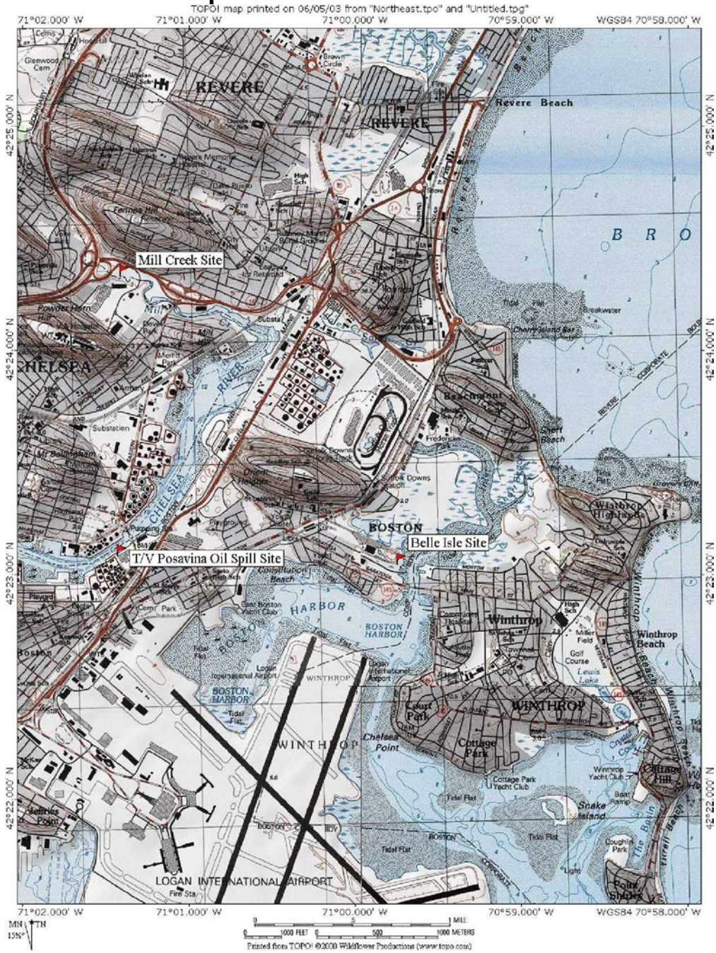
Figure 2 Locus Map of Mill Creek and Belle Isle Restoration Sites