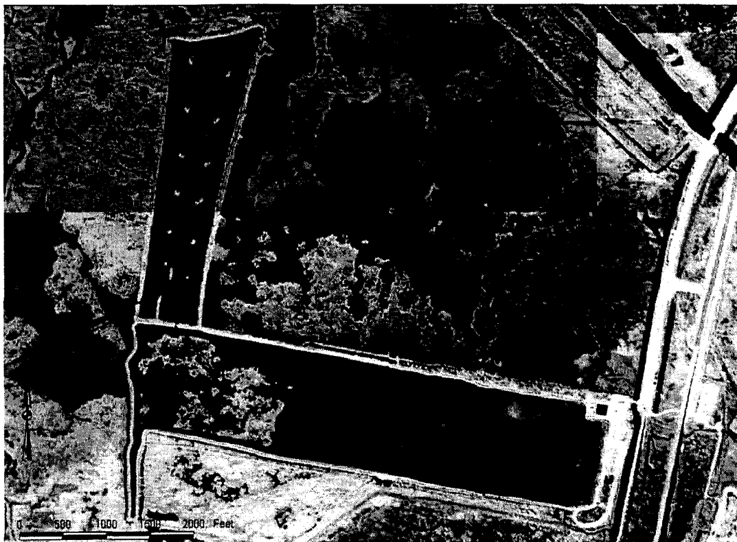
Figure 2-1. The Bailey Waste Superfund Site, Orange County, Bridge City, Texas

Industrial (e.g., sludge from local petrochemical industries) and municipal waste disposal at the Site began in the 1950's. Industrial waste disposal was discontinued in the late 1960's, but municipal and construction wastes were accepted until about 1971. Wastes were deposited in a series of pits that were excavated along the northern and eastern levees of pond A, and in a drum disposal area on the southern levee of pond A.