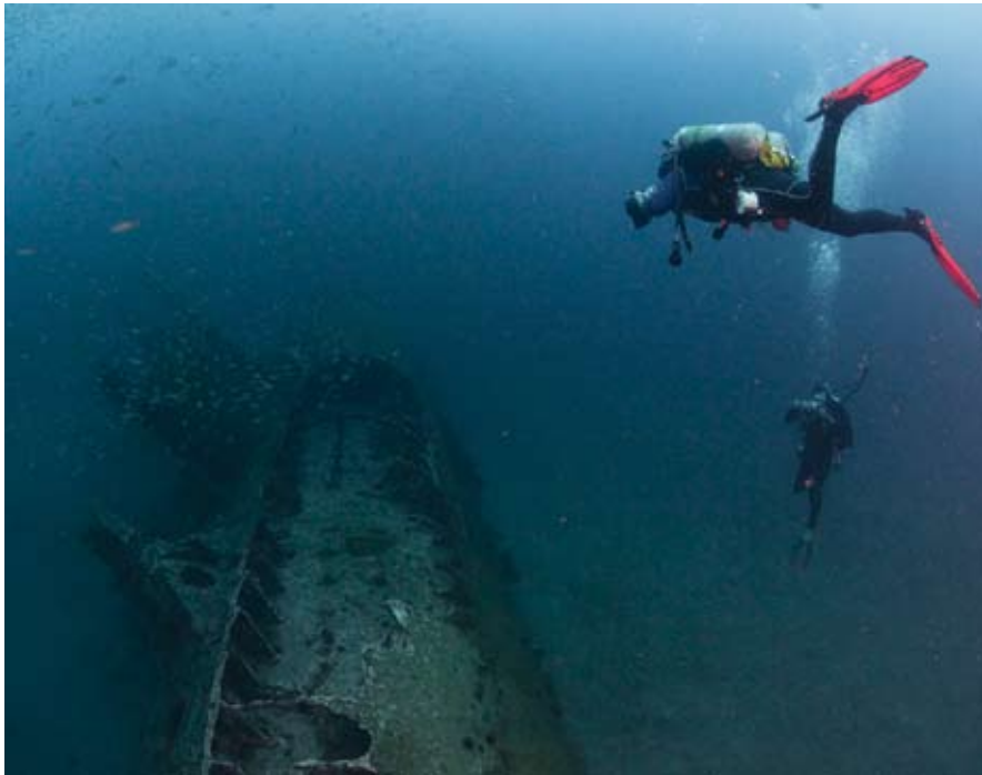
Divers documenting port side of U-352.

off the U.S. coast during the war. Within days of its loss, the Navy recovered the 20-millimeter anti-aircraft gun. Sadly, over the years the site has been severely damaged by aggressive relic-hunters.