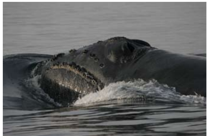
North Pacific right whale ( Eubalaena japonica ).

Rutgers will provide model results (wind, ice, and surface water speed and direction and extent of ice cover) as a 1986-2006 hindcast simulation and will document the study results through a model manual, final report, and in a peer-reviewed journal publication.