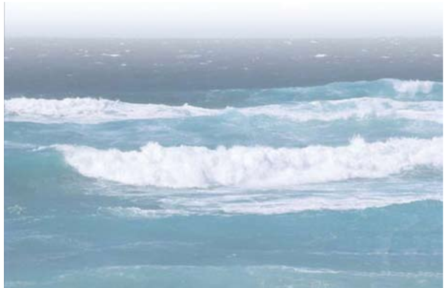
Wave power, an alternative energy source.

In an effort to be more responsive to stakeholders and industry, MMS announced an Interim Policy in November 2007 to "jumpstart" the activities of the Alternative Energy Program. The Interim Policy allows developers to gather basic resource data and perform technology testing activities through the issuance of limited leases. The limited leases are issued for only 5 years and will not allow for commercial generation of electricity nor convey future rights for commercial development. The MMS believes that limited leases are an important component of the Alternative Energy Program because they give developers an opportunity to collect data and test technology while MMS completes its rulemaking process. The Interim Policy will effectively end once final rules are in place, and developers can