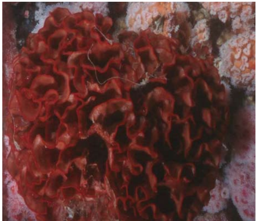
Watersipora subtorquata.

Results indicate that Watersipora subtorquata (an encrusting bryozoan) contains a red pigment, not previously described before in the literature, which is a viable candidate for further cell division studies. An organic extract from Diadumene sp. (an anenome) was found to inhibit proliferation in the human lung cancer cell line. Results of studies on crude extracts of Diadumene sp. and Strongylocentrotus purpuratus