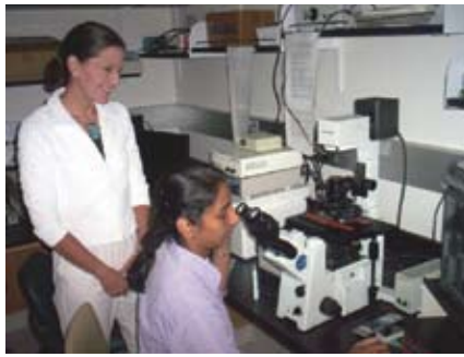
Deputy Secretary of the Interior Lynn Scarlett tours biotech lab.

through a Cooperative Agreement between MMS and the University of California at Santa Barbara (UCSB). (For more information about marine biotechnology research and potential, see MMS Ocean Science January/February/March 2008.)