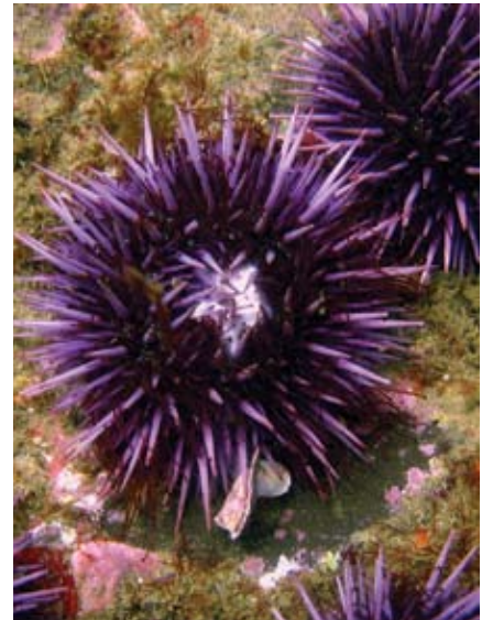
Strongylocentrotus purpuratus .

Offshore oil and gas platforms may eventually provide not only needed energy for our Nation but also a renewable source of marine organisms suitable for biomedical applications.