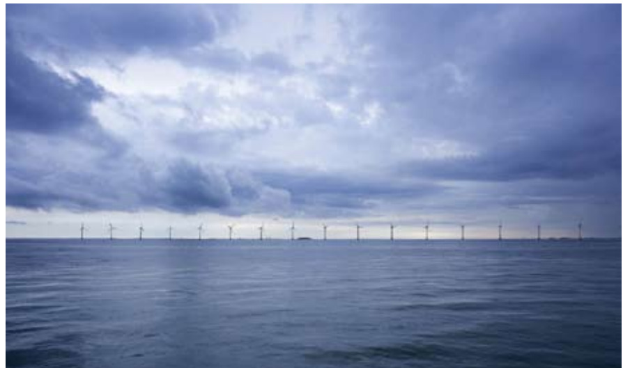
Offshore wind farm.

On July 9, 2008, MMS published a draft proposed rule, “Alternative Energy and Alternate Use of Existing Facilities on the Outer Continental Shelf.” The rule will set forth a comprehensive regulatory framework for alternative energy development and production