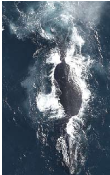
North Pacific right whale.

by extensive illegal Soviet catches in the 1960's. During 1965-1999 there were 82 sightings in the entire eastern North Pacific; most were in the Bering Sea and adjacent areas of the Aleutian Islands. There are no reliable estimates of the current abundance of North Pacific right whales, but the eastern population is widely regarded as being well below a hundred animals. Over the past 40 years, most sightings in the eastern North Pacific have been of single whales. In the last few years, small groups of right whales have been sighted, but there were no confirmed sightings of calves in the 20th century, and only a few in recent years. In 2006, the National Marine Fisheries Service designated two