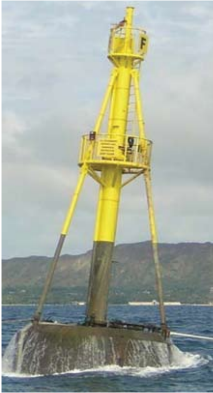
Wave energy conversion device, OPT PowerBuoy , point absorber. From “Wave and Tidal Energy: What’s Happening?” study by Robert Thresher.

for all four of the proposed lease areas off southeast Florida.