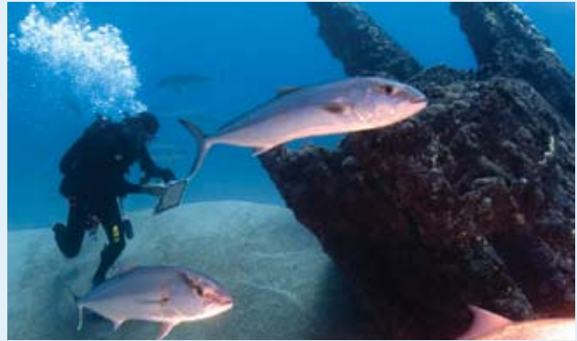
Archaeologist Dave Ball documenting conning tower of U-701 .

DB: Most of the sites we've identified at MMS were discovered through industry surveys that are required as part of the permitting process. For example, a sonar target identified during surveys for the Mardi Gras line in 4,000 feet of water turned out to be the remains of