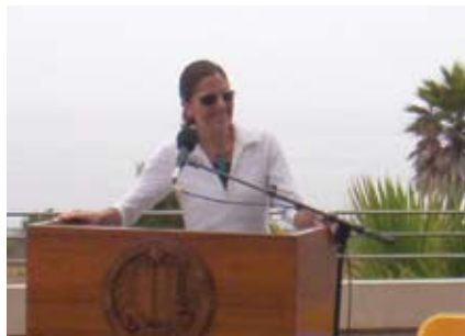
Deputy Secretary of the Interior Lynn Scarlett announces biotech study.

The potential for harvesting marine organisms that hold valuable natural products has gained interest worldwide. However, harvesting sufficient quantities of such organisms for applied uses could have significant ecological impacts. The Outer Continental Shelf (OCS) offshore oil and gas platforms, which provide habitat for marine communities of over 50 species of