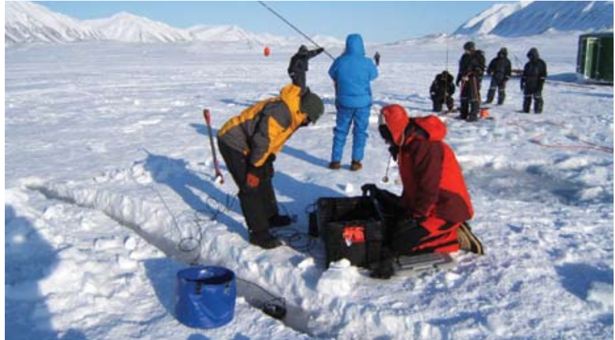
Remote-sensing experiments to detect oil in and under ice, conducted at Svea, Norway.

The TAR Program has a well-established process to identify, fund, and administer research and