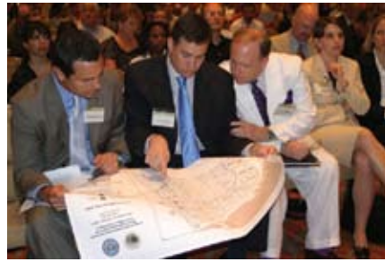
Lease sale attendees review blocks receiving bids.