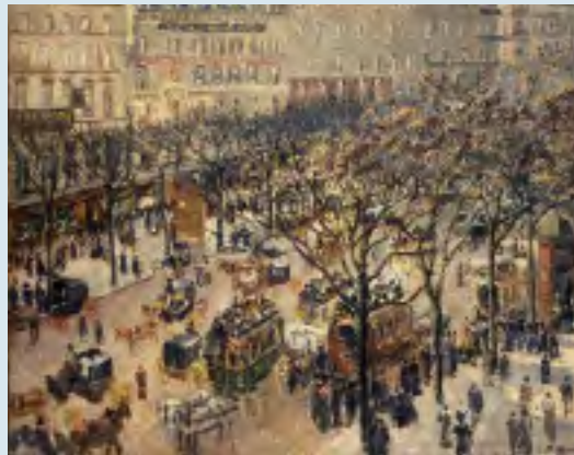
Artists painting winter

top: George Henry Durrie, Winter in the Country , c. 1859, National Gallery of Art, Washington, Avalon Fund