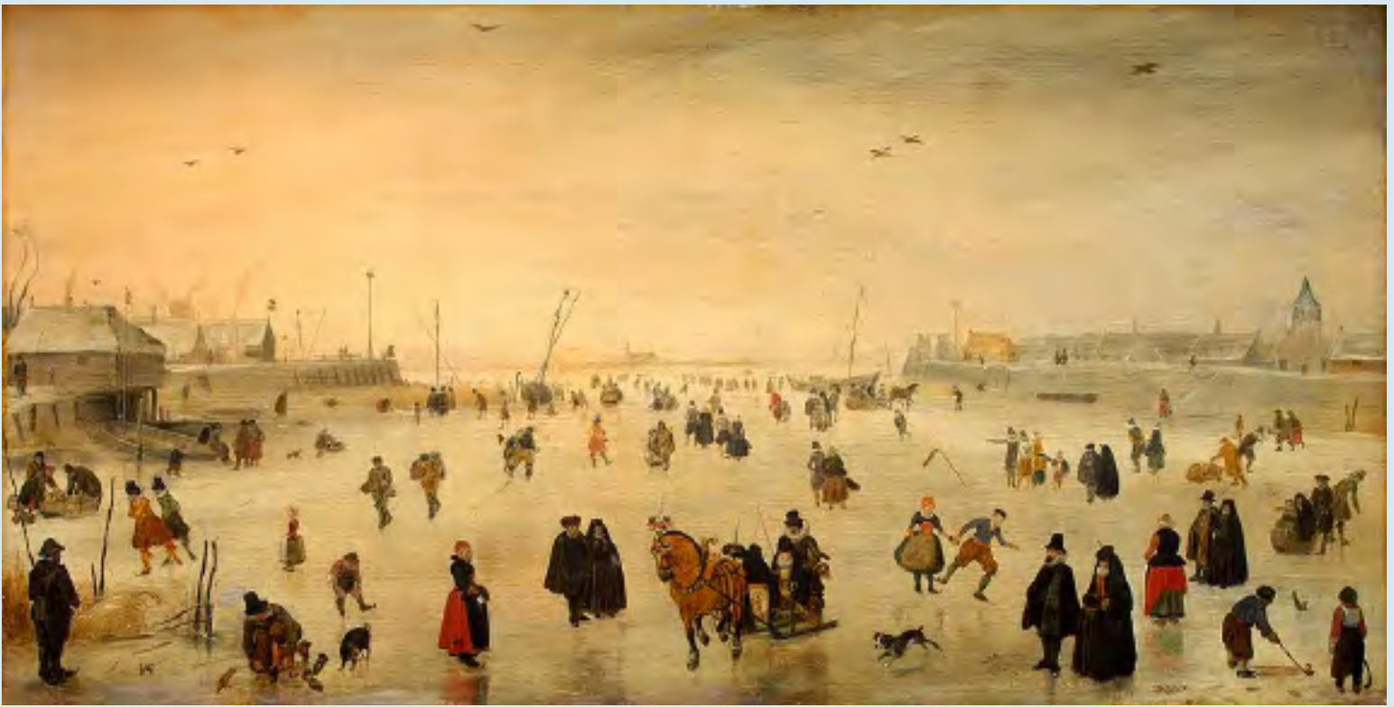
Hendrick Avercamp, A Scene on the Ice , c. 1625, National Gallery of Art, Washington, Ailsa Mellon Bruce Fund