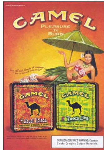
R.J. Reynolds Tobacco Company advertisement for Kauai Kolada variant of Camel cigarettes

In 1990, Japan Tobacco Inc. began advertising Japan’s best-selling Mild 7 cigarette brand on billboards in the Koreatown and Little Tokyo areas of Los Angeles. Mild 7 packages were stacked in displays in restaurants and stores. Retailers reported that demand for the cigarettes was strong. The marketing manager at JATICO, Japan Tobacco’s U.S.