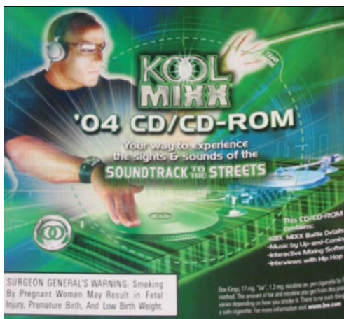
Kool Mixx CD cover, included with the Kool advertisement in Vibe magazine and in bar promotions in 2004

Kool Fusion specialty-flavored menthol cigarettes, advertisements with a Kool Mixx CD (compact disc) attached to the advertisement in Rolling Stone and Vibe , direct mail promotions, and a DJ Web site, all designed to reach young urban African Americans. 11