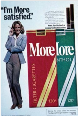
I'm More satisfied

next to a pyramid. This ad was judged by members of the Department of Research in Tobacco Smoking and COPD at the National Institute of Respiratory Diseases in Mexico City as having “unquestionable sexual content,” 33 (p.2018) and male adolescent participants perceived a naked man embedded in the picture of the camel.