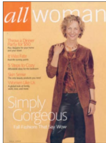
All Woman magazine sent by Phillip Morris to women smokers on the corporation's direct mail list, Fall 2003

Populations may be targeted by public relations and philanthropic efforts aimed at the leadership of priority populations. The rationale for this approach is described in chapter 6. Donations such as R.J. Reynolds's support of Hispanic Chambers of Commerce 14 and Philip Morris's support of African American scholarships 15 might undermine potential opposition to the tobacco companies and their marketing activities, help legitimize their products among members of the recipient groups, and build allies in antiregulation campaign efforts.