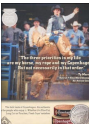
World Champion All-Around Cowboy Ty Murray states, "The three priorities in my life are my horse, my rope and my Copenhagen. But not necessarily in that order."

Sports sponsorship provides additional opportunities to pair tobacco with imagery that would appeal to men and to sign up attendees for compelling direct mail promotions (see chapter 6 for a further discussion of tobacco sponsorship). In 2001, tobacco sponsorship included Winston's association with the National Association