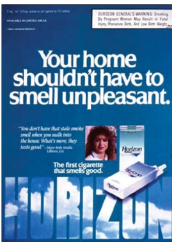
R.J. Reynolds advertisement for Horizon cigarettes

These products—collectively referred to as potential reduced-exposure products (PREPs) 27 —appear to be a key effort by the industry to protect against smoking cessation in the face of mounting concern about the risks of smoking and exposure to secondhand smoke. PREPs may also