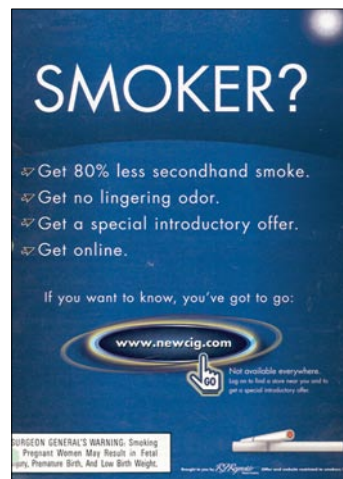
R.J. Reynolds advertisement for Eclipse www.newcig.com, 2004