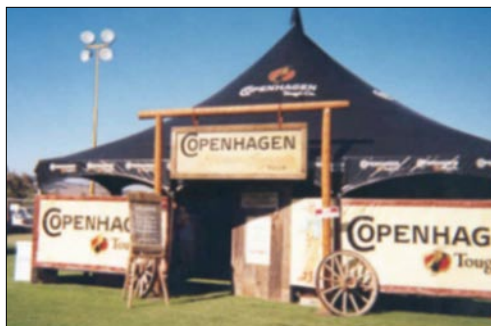
Copenhagen booth at PRCA Rodeo, Rancho Mission Viejo, California, 2002

Campaigns target or reach specific groups via channels used by concentrations of these populations at times when they may be persuaded to initiate smoking or may be making other kinds of changes in their lives. One can identify important target populations and the brands aimed at them by examining the types of magazines and tobacco-sponsored events used by certain brands to reach narrow populations of interest. Magazines have long been used by tobacco companies to reach specific demographic and lifestyle audiences. 8 Events also appeal to relatively narrow fan bases. The U.S. Smokeless Tobacco Corporation (USST) has placed Skoal free-sample booths at motorcycle races and Copenhagen booths at Professional Rodeo Cowboys Association (PRCA) rodeos, reaching a high proportion of young males. 9,10 Often, channels are combined for a comprehensive campaign “narrowcast” through multiple channels reaching the same group. This method is exemplified by the Kool Mixx DJ (disc jockey) campaign using “poets of urban hip hop,” models, settings, and language of urban nightlife to reach young African Americans. The channels include a series of urban tobacco-sponsored bar nights with samples of newly designed