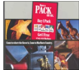
"Come to where the flavor is. Come to Marlboro Country." A direct mail promotion with a coupon insert for "Buy 1 Pack Get 1 Free" sent to an adult smoker in California, October 2002