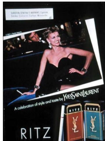
Ritz couple in formal attire