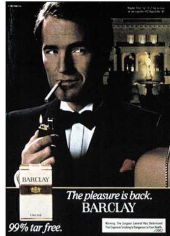
Barclay's "The Pleasure Is Back"

Packaging design has also been intended to create specific associations and may be designed with an eye to circumventing various advertising restrictions. 34 Colors are used to further the illusion of taste and reduced risk, with green packages (menthol) suggesting coolness, red packages suggesting full taste, and white packages giving the impression of low tar and safety while preserving satisfaction (see chapter 3). 24,34 Mainstream brands have experimented with packaging that makes a strong lifestyle statement (see chapter 4). R.J. Reynolds redesigned its Winston packs and billboards to feature the first part of the name “Wins” on the front, and created a flask-shaped, curved pack for its high-tech “S-2” campaign. Kool cigarettes were given away in free samples and test markets in 2004 in a new blue and green Smooth Fusions pack that unfolds like a book and, in bar promotions, features a cardboard wrapper that can be reused on