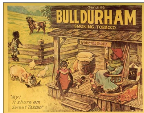
American Tobacco Company advertisement for Bull Durham tobacco

Tobacco advertising and promotion to African Americans have been marked by special products, imagery, themes, and locations designed to reach and appeal to black audiences. Around 1900, the American Tobacco Company advertised Bull Durham smoking tobacco with the caricatured images of blacks that were commonly used in that era. In the final decades of the 20th century, before the MSA banned cigarette billboards, several studies found disproportionately high rates of cigarette advertisements on billboards in predominantly African-American urban areas. 87,110,111(p.221) Tobacco companies have run