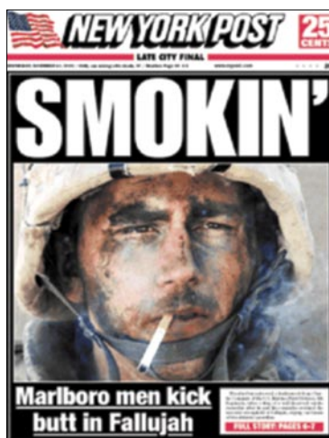
The new “Marlboro Man” as depicted by the New York Post in November 2004

The different price structure of military stores (commissaries and exchanges)—including limits on the markup of wholesale prices and exemptions from state and local taxes (including those imposed on tobacco products)—has permitted the sale