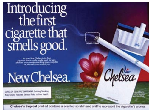
R.J. Reynolds advertisement for Chelsea cigarettes

Products have also been designed and promoted to allay concerns about secondhand smoke and to improve the social acceptability of smoke. 92 Memos from Philip Morris, Brown & Williamson, and R.J. Reynolds in the 1980s and early 1990s describe efforts to develop additives and technologies that could reduce or mask the odor, visibility, and irritation of secondhand smoke. In 1989, R.J. Reynolds introduced Chelsea cigarettes, which were reintroduced as Horizon in 1990; 92 both brands were marketed with identical claims as “the first cigarette that smells good,” backed up by “scratch ‘n sniff” boxes in their advertisements. Several tobacco products have been introduced to address concerns about secondhand smoke. Newer products such as Omni and Accord convey the impression that they have broken away from the others to offer reduced risk to the