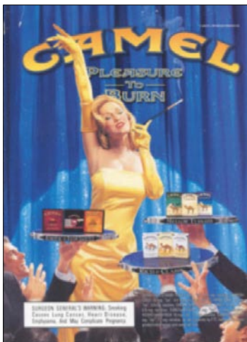
Camel “Pleasure to Burn” advertisement

Exotic Flavors, and Turkish Gold brand families: “Rich and Classic,” “Exotic and Indulgent,” and “Mellow Turkish.” 22