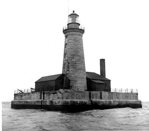
(L to R) Southwest Pass, LA; Point Fermin, CA; Spectacle Reef, MI