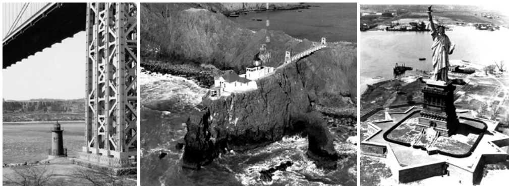
(L to R) Jeffrey's Hook, NY; Point Bonita, CA; Statue of Liberty