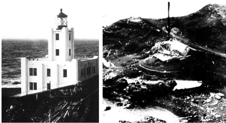
Scotch Cap Light: before (L) and after a tsunami on 1 April 1946