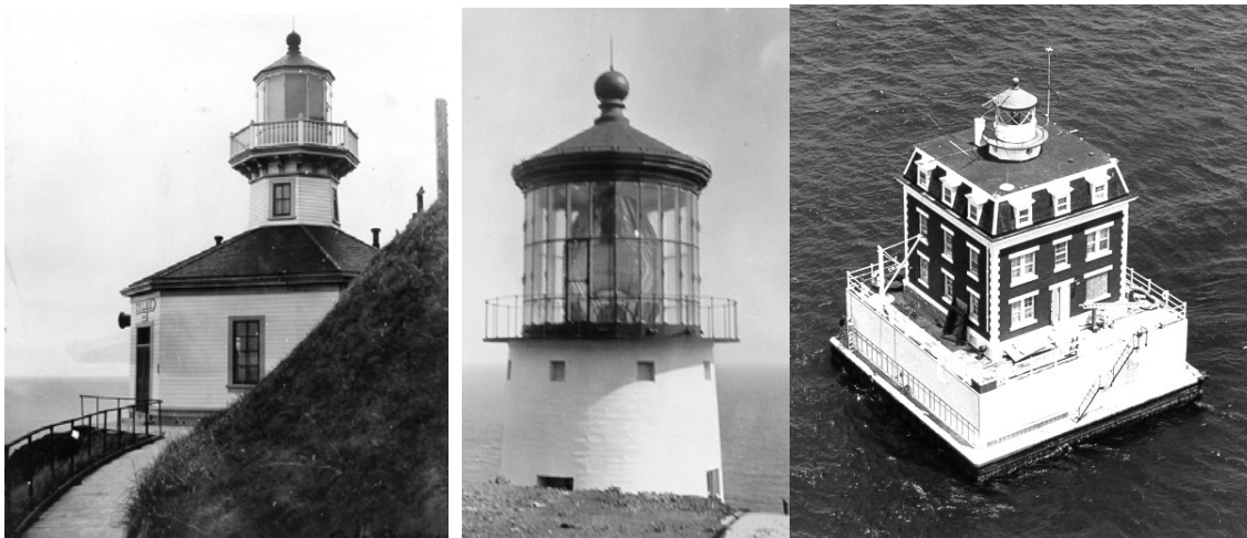
(L to R) Cape Sarichef, AK; Makapuu Point, HI; New London Ledge, CT