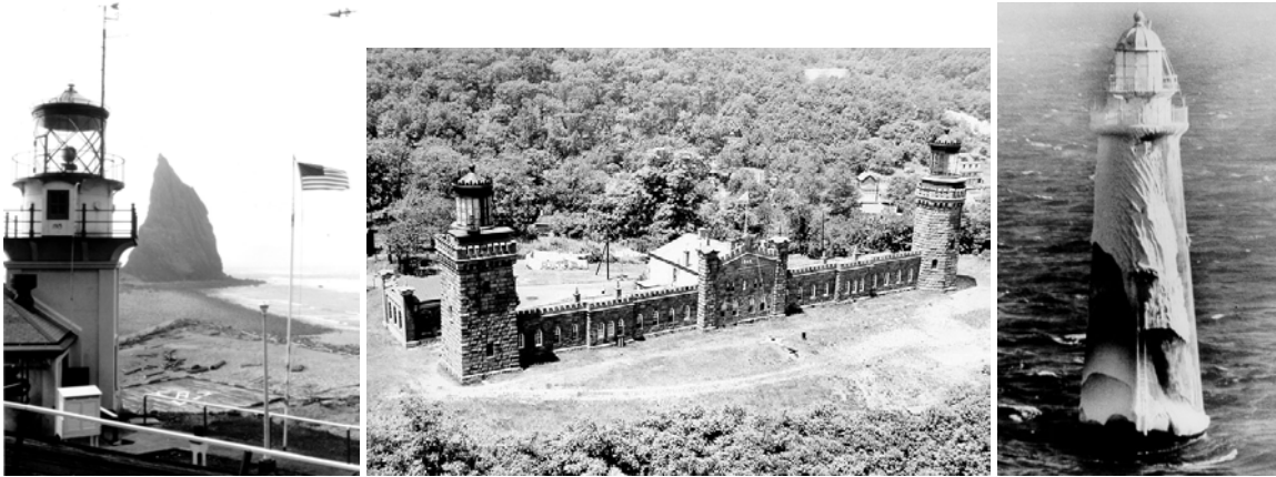
(L to R) Cape St. Elias, AK; Navesink, NJ; Minot's Ledge, MA