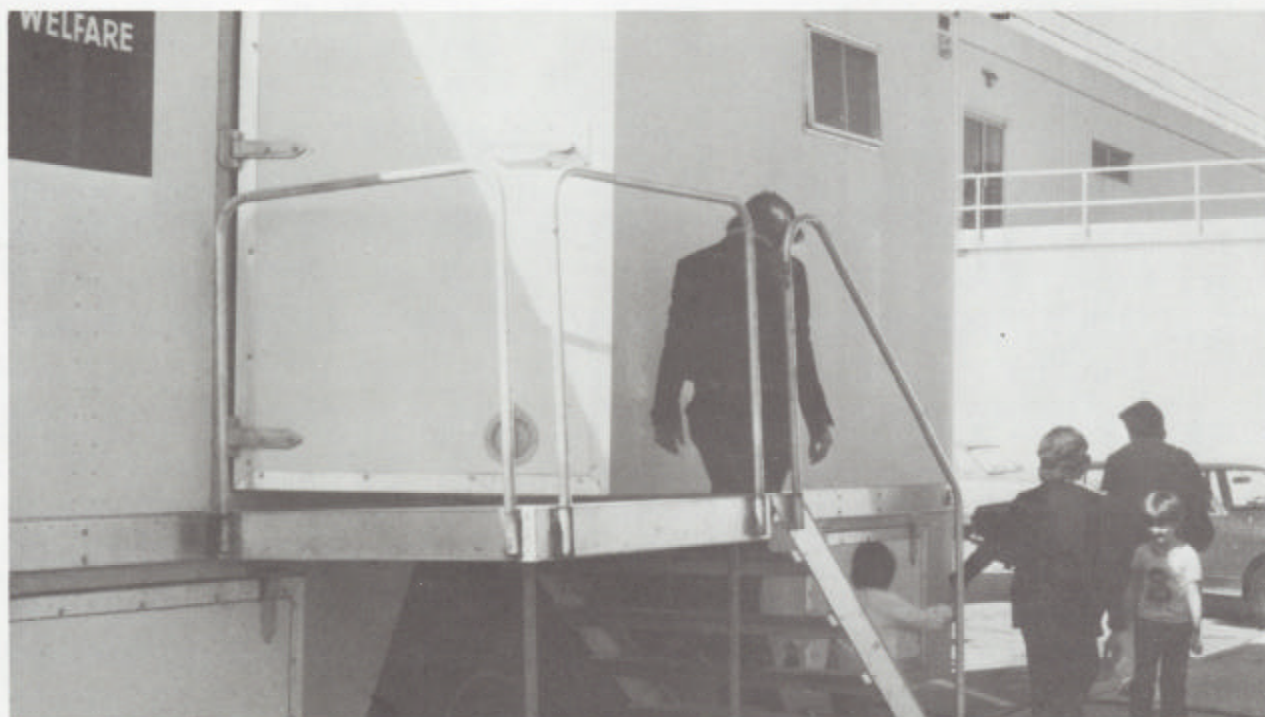
Over 62,000 Americans have taken part in the National Health and Nutrition Examination Surveys. Upcoming, a special survey of Hispanics.

core of statistical competence can be maintained in each State to support a number of Federal and State programs as well as other users of health data.