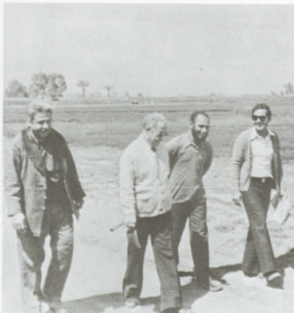
Interviewers in the Egyptian countryside

binations, (for example, male hysterectomies), but other types of errors are likely to exist in varying degrees. Different types of health personnel, from chief physicians to ward clerks, may report and code hospital data, and the types of personnel vary within as well as between countries.