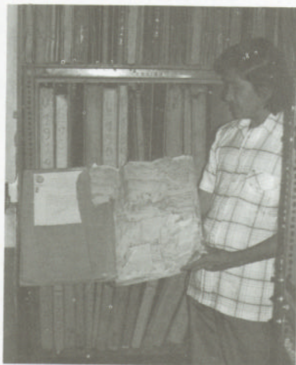
Under Peru's improving vital registration system, birth and death records are permanently preserved on microfilm. Because of poorer quality paper, these recent records have deteriorated faster than older records