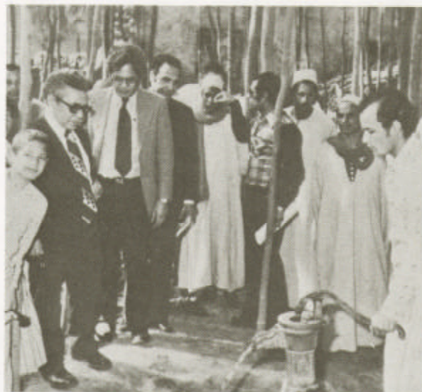
Water supply for an Egyptian village, one of the aspects of environmental health being surveyed in the Health Profiles of Egypt project

The reports on hospital statistics include "The Status of Hospital Discharge Data in Six Countries" (1),