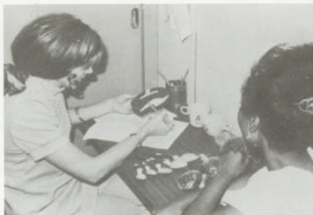
Food portion models used in NHANES to aid examinees in reporting amounts and types of food consumed in the 24 hours before the interview

Research and evaluation of the NTHIS will con-