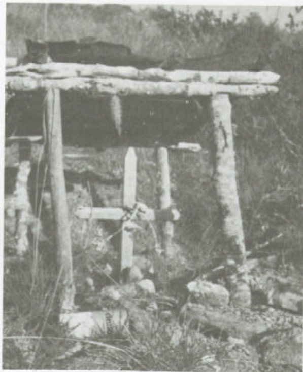
Vital registration officials in Latin America call graves such as this "clandestine" because they often represent unreported vital events—perhaps both the birth and death of a baby or only a death

A special relationship exists between the WHO Center and Statistics Canada, the Canadian Government agency responsible for use of the ICD in that country. Close ties also exist among all six WHO reference centers. However, the North American Center has especially close contact, through the Pan American Health Organization (PAHO) with the Centers in Caracas and São Paulo, since these three Centers are within the Western Hemisphere responsibilities of PAHO, the WHO Regional Office for the Americas.