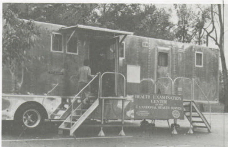
Specially designed mobile examination centers were equipped with X-ray and laboratory facilities, soundproof booth for hearing tests, and other special features needed to assure high quality data

dent in his "Special Message on the Nation's Health Program" urged the Congress "to authorize the Public Health Service to secure periodically needed information on the incidence, duration, and effects of illness and disability in the Nation."