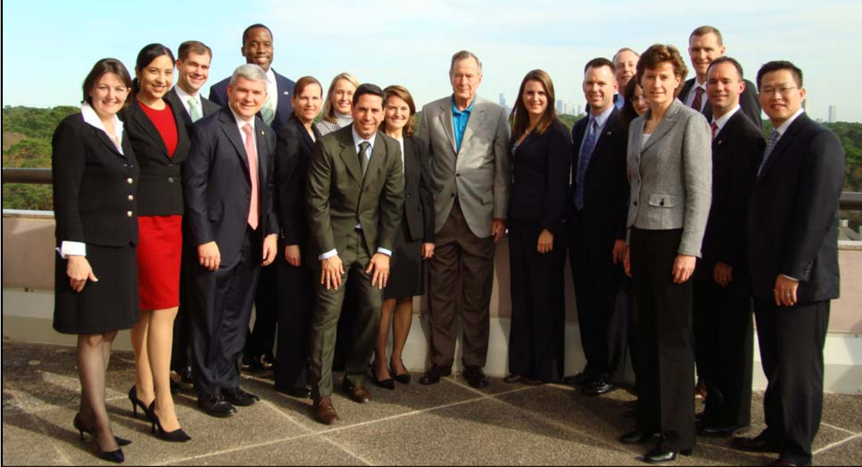
2007-2008 Fellows with President George H.W. Bush in Houston