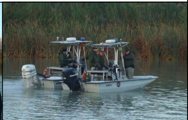
2007-2008 White House Fellows aboard a Border Patrol boat, such as the one pictured at right.