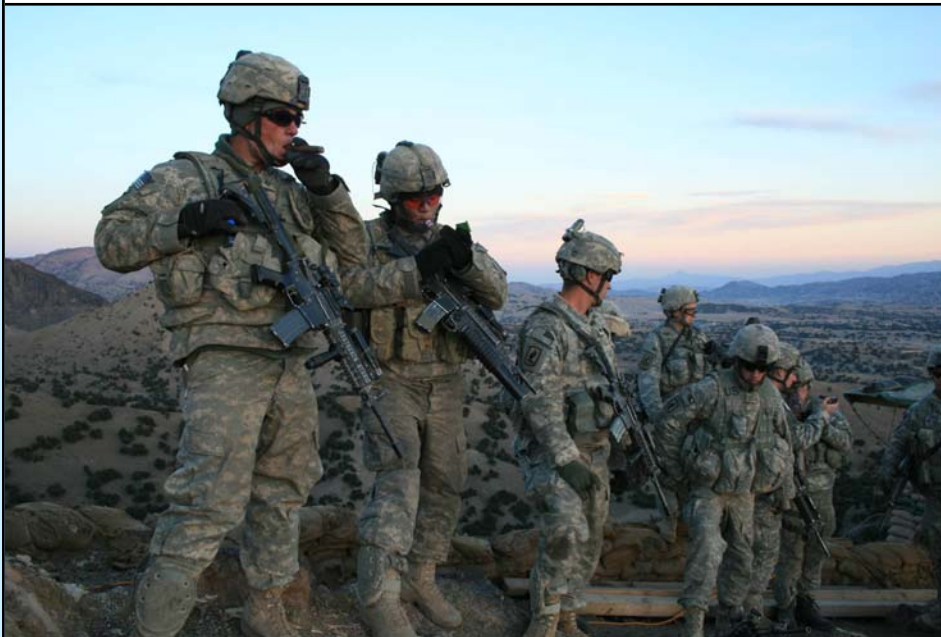
New Year's Eve in Afghanistan