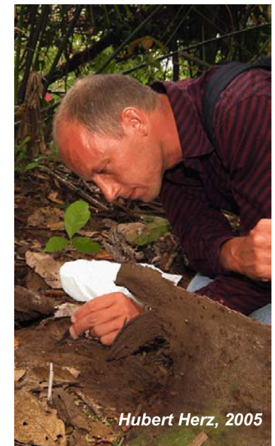
Hubert Herz, 2005

Herz et al. first used a rapid and nondestructive method, involving the sampling of refuse deposited by ants outside their nests, as a proxy for measuring the daily harvest of leaves. Then they collected data from nearly 50 nests over 15 months in a Panamanian forest and calculated that the ants were actually responsible for only