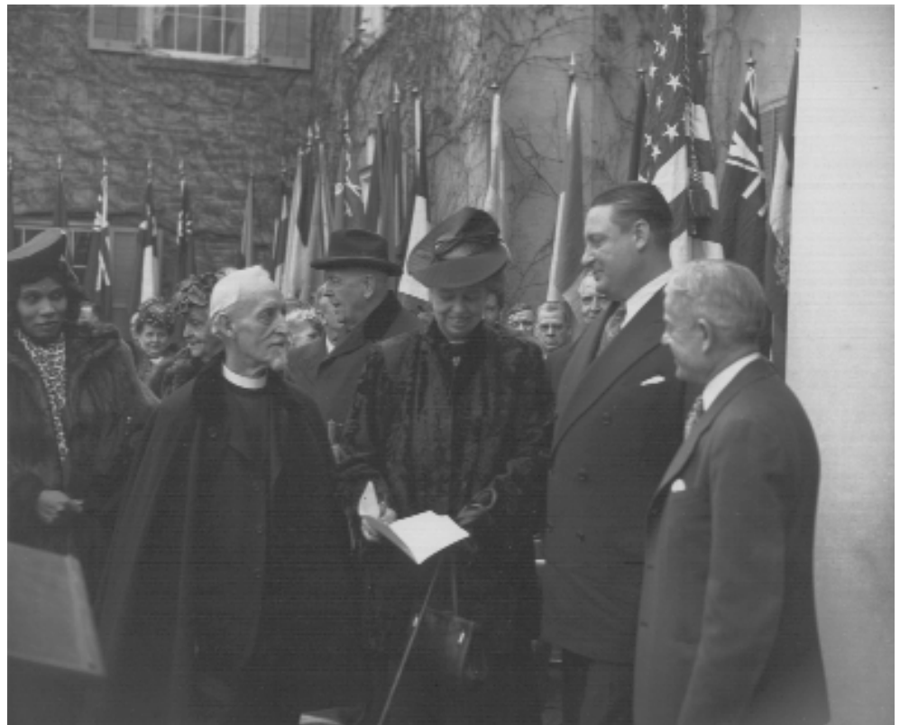
Eleanor Roosevelt at opening of home of Franklin D. Roosevelt, April, 1946.