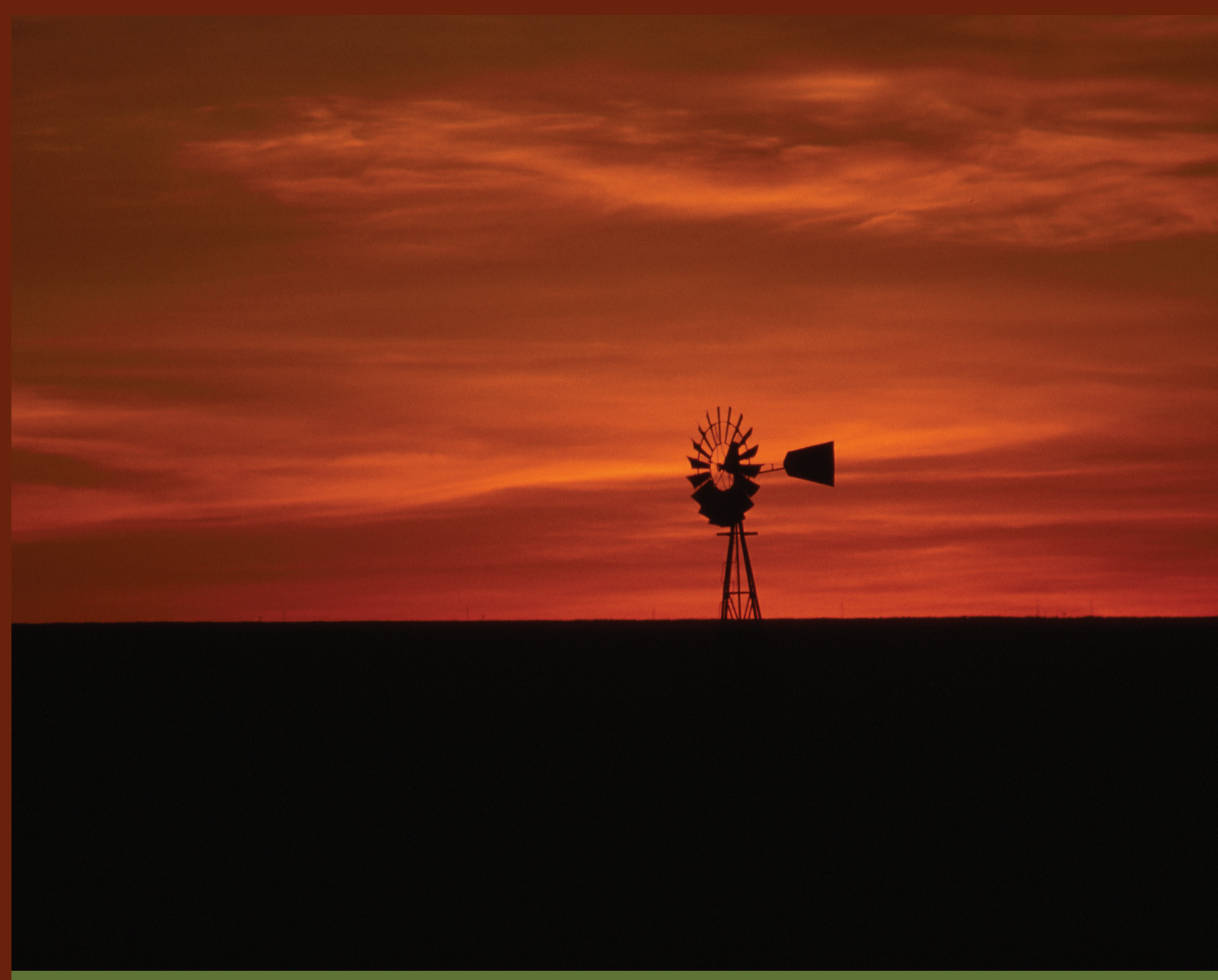
NEPA encourages harmony between people and their environment.