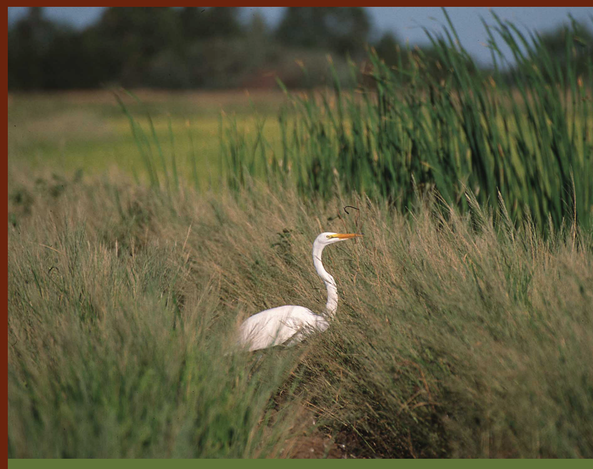
NEPA is intended to enrich the understanding of ecological systems and natural resources.