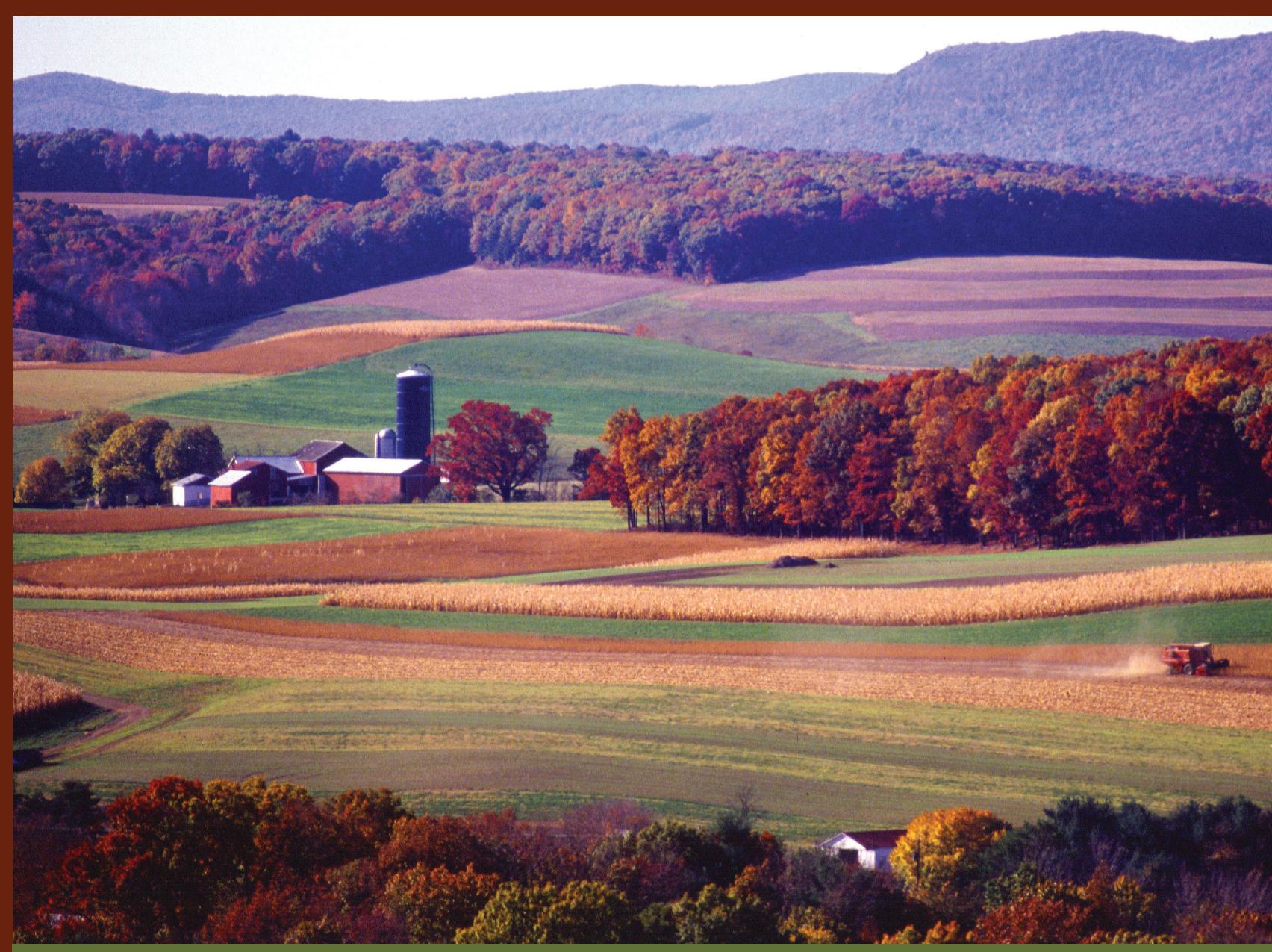
NEPA regulations ensure that environmental impacts are considered.