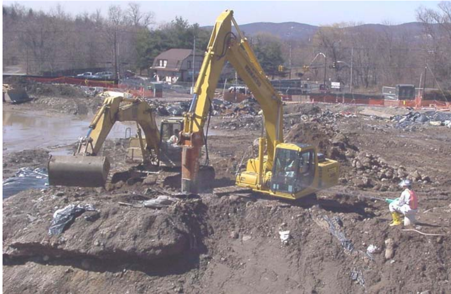
Wayne Interim Storage Site