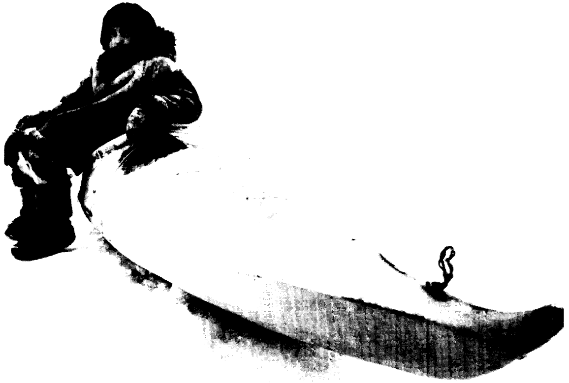
Old seal hunting ways of Inupiat people near Kivalina, Alaska. This boy is resting on a seal skin kayak.