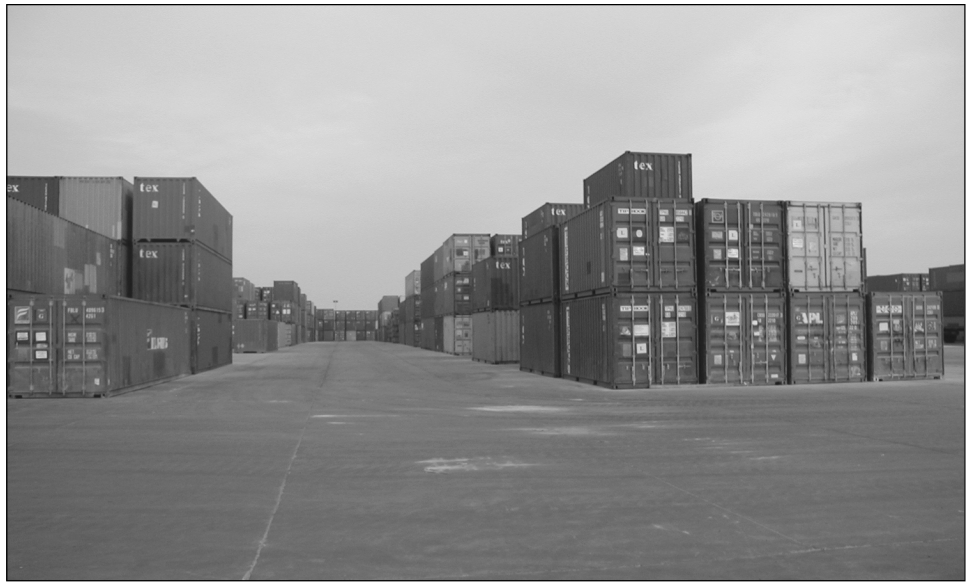
Figure 2: Military Storage Containers in Kuwait (October 2006)