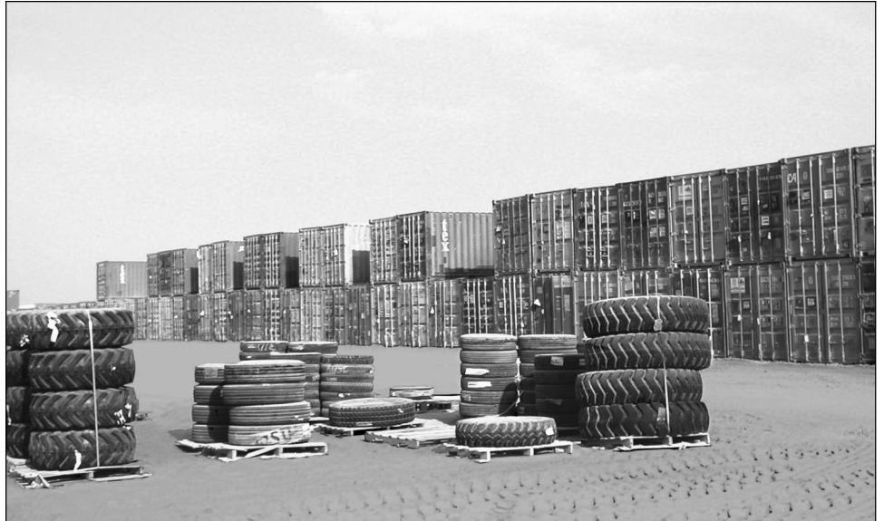
Figure 3: Views of Container and Yard Storage at Army General Support Warehouse, Camp Arifjan, Kuwait (October 2006)