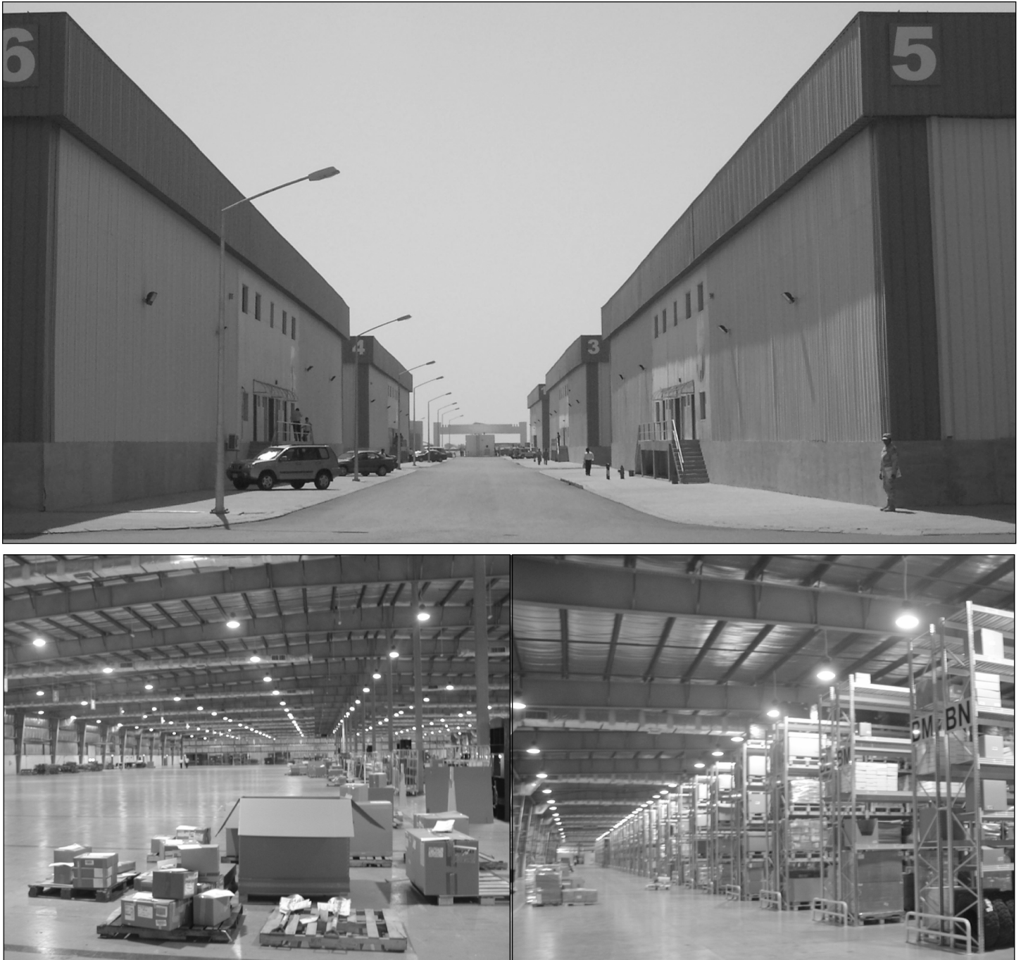
Figure 4: Exterior and Interior Views of Warehouses at the DLA Distribution Depot, Kuwait (October 2006)