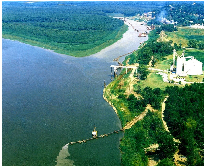
Dredging in Elvis Stahr Harbor