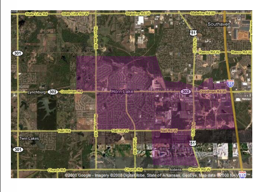
Study Name: Horn Lake Master Plan, Mississippi