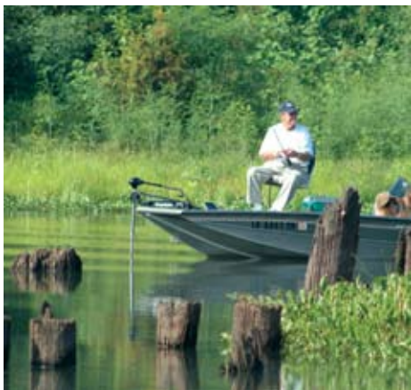
Fishing on Henderson Swamp