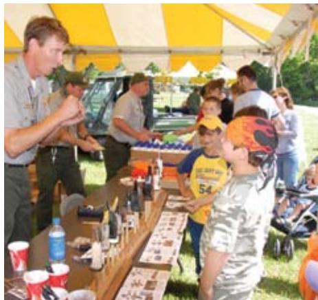
Duck calling STEP OUTSIDE Event

STEP OUTSIDE® Day provides a free, fun, hands-on introduction to