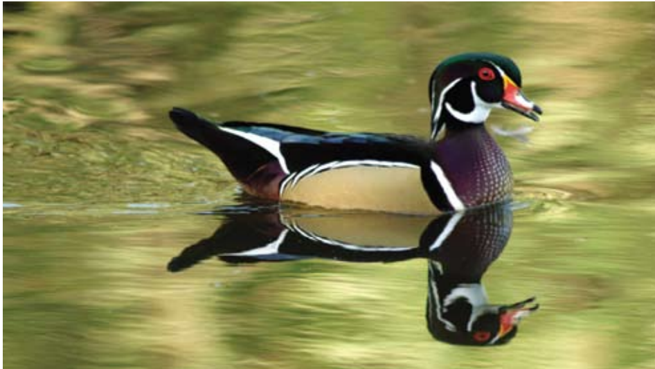
Male Wood Duck

fishermen, bird watchers, hikers, paddlers, bicyclists and others enjoy a unique wilderness experience year-round. Working with state and other federal agencies, the Corps of Engineers provides public access to the basin, supported by minimal development that ensures protection of the area's remarkable habitat.