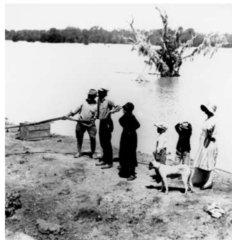
People on levee during 1927 flood

Breaching levees, drowning crops, inundating towns and paralyzing industry, the Mississippi River flood of 1927 was among the most destructive in U.S. history. Over an 11-month period, the flood displaced nearly 700,000 Americans,