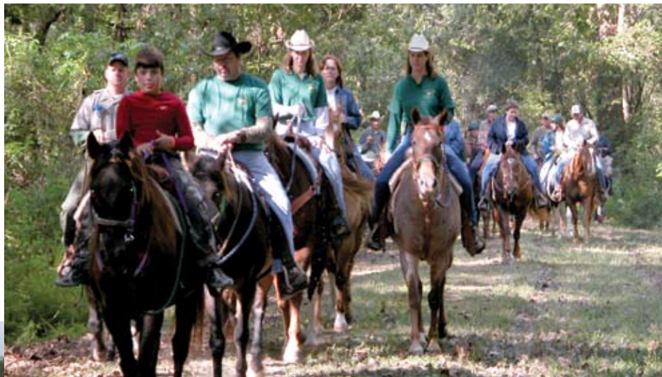
Trail Ride on Indian Bayou