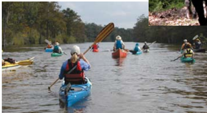
Canoeing on Bayou Courtableau

The Corps of Engineers, in partnership with Atchafalaya Paddling Trails, the state of Louisiana and volunteers, has mapped out a network of paddling trails in the Atchafalaya Basin ( www.atchafalayapaddletrails.org ). Marked by reflective blue-and-white posts, these trails allow visitors to navigate the bayou without a guide.