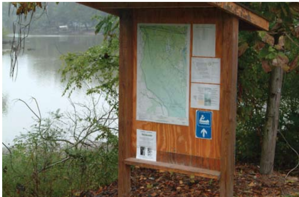
Paddling Trail Head

Prior to your trip, visit the U.S. Army Corps of Engineers web site, www.mvn.usace.army.mil , click “Recreation,” then click “Atchafalaya Basin Floodway System.” Detailed hunting safety guidelines are available through this site, as are maps for some public access areas of the floodway.