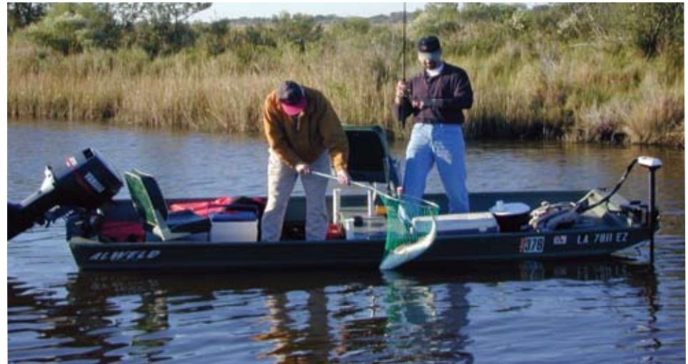
Fishing in the Atchafalaya Basin

Blue crab, shrimp and crawfish are harvested recreationally and commercially in the basin.