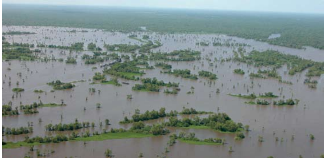
Aerial view of Henderson swamp

The MR&T project was designed to safely channel a flood of up to three million cubic feet per second (cfs) — a flow even larger than the 1927 inundation — to the Gulf of Mexico. Half of this flood, 1.5 million cfs, would pass through the lower Atchafalaya Basin via the