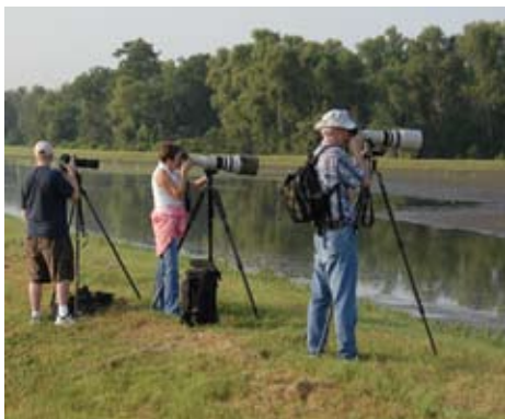
Wood Stork Birding Event

Nearly 300 species of native and migratory birds have been observed in the Atchafalaya Basin, including songbirds, raptors, pipers, plovers and waterfowl. Here they find prime nesting, resting and breeding habitat. An important wintering area for waterfowl on the Mississippi Flyway, the basin is part