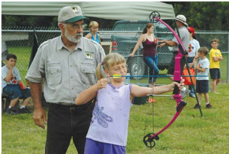
Archery at STEP OUTSIDE

the outdoors for children, families and people with disabilities. Activities include fishing, skeet shooting, archery, bird watching, photography, crafts and boat rides.