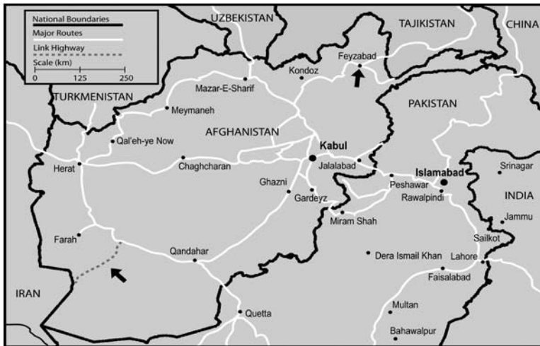
Map 2. Zaranj-Delaram Highway Link from Iran, across Afghanistan, to Tajikistan.

Pakistan. The need to bypass Pakistan, which had consistently stonewalled Indian requests for overland commercial access to Afghanistan and Central Asia, partially drove New Delhi's plan. 35 This plan naturally creates anxiety in Islamabad, which cannot at this point be certain of the success of its own Gwadar scheme (see Map 1).