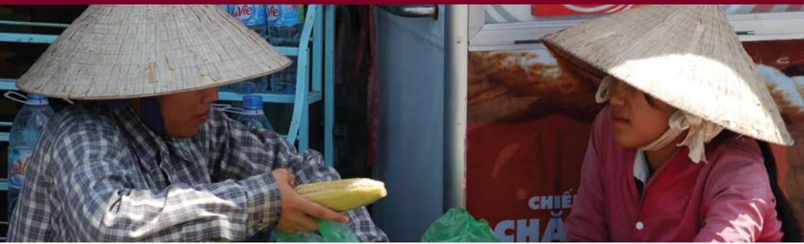
A Market scene from the Mekong Delta.