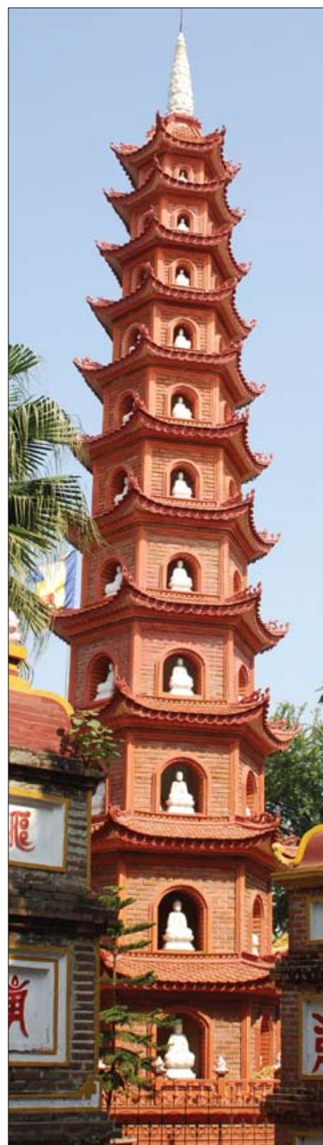
A pagoda in Hanoi