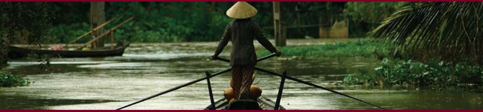
A river on the Mekong Delta