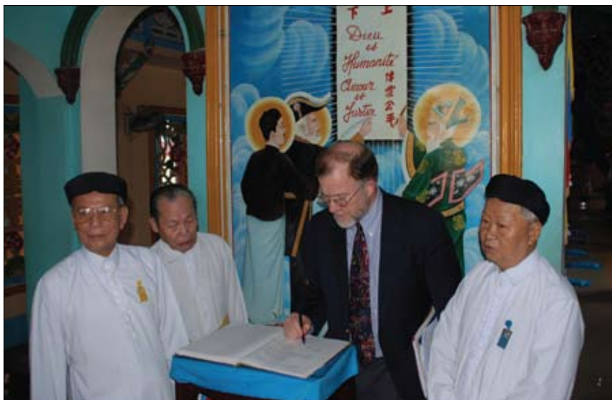
Commissioner Cromartie meets with the leadership of the Ho Chi Minh City Cao Dai.

The government continues policies to maintain control of most religious organizations and restricts their activities and growth through a pervasive security apparatus, bureaucratic impediments, the process of official recognition and registration, and the requirement of official permission for certain activities. Independent religious activity remains illegal, and legal protections for government-approved religious organizations are both vague and subject to arbitrary or discriminatory interpretations based on political factors. The new Ordinance on Religion and Belief, which came into effect in November 2004, reiterates citizens' right to freedom of religion, including the freedom not to follow a religion; it also states that violations of these freedoms are prohibited. However, while the Ordinance promises needed protections, they are often not fully implemented or not available