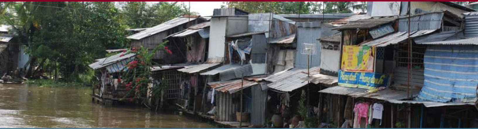
A river community in the Mekong Delta.