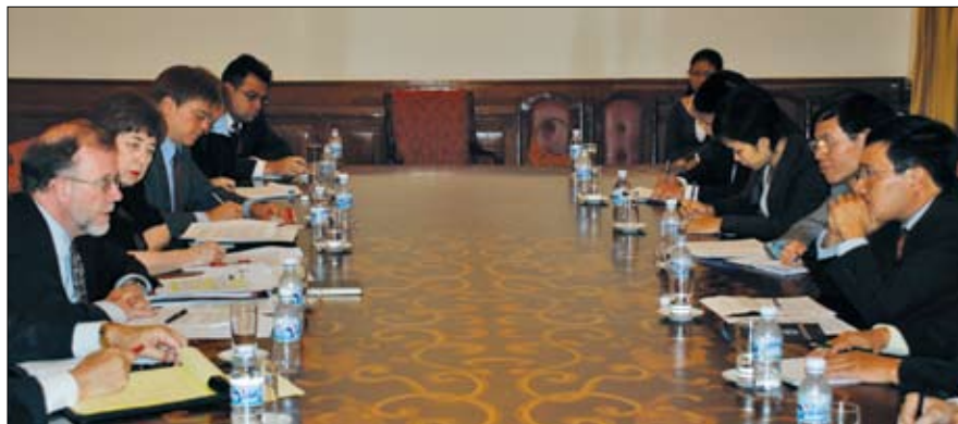
Commissioners Cromartie and Gaer with the Vice Minister for Foreign Affairs, Pham Binh Minh, Hanoi.