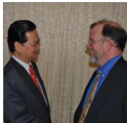
Commissioner Cromartie speaks with the Prime Minister of Vietnam, Nguyen Tan Dung, Hanoi.