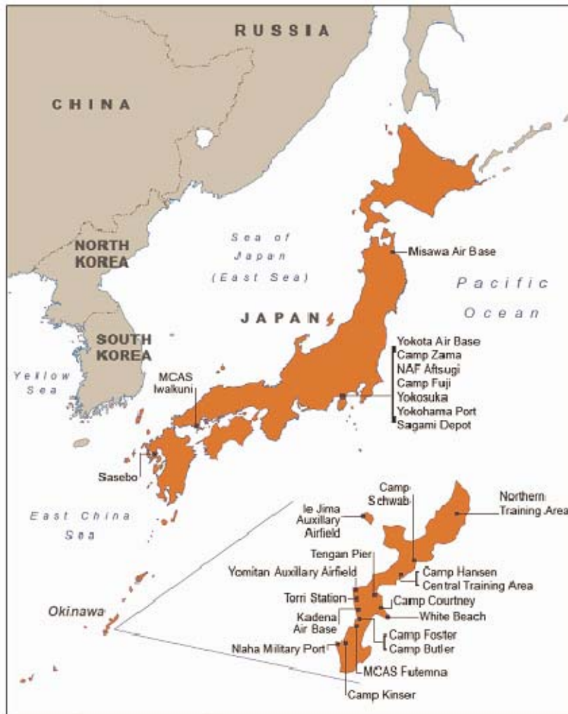
Figure 2. Map of Military Facilities in Japan

A U.S.-Japan program of cooperative research and development of anti-ballistic missiles began in 1999. The decision to acquire the ground-based U.S. Patriot Advanced Capability-3 (PAC-3) system and the ship-based U.S. Standard Missile-3 system was justified largely on the basis of North Korea's missile program. In December 2005, Japan's Defense Agency agreed that Japan will pay over $1 billion for the project over nine years. Following North Korean missile tests in July 2006, officials announced that the deployment of the PAC-3 system to Okinawa would accelerate. In December 2007, a Japanese destroyer successfully intercepted a missile in a test exercise near Hawaii.