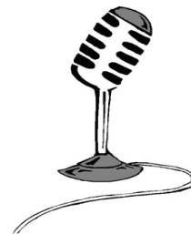
Bart Gordon, Chairman

After the President's State of the Union Address Chairman Bart Gordon remarked how the 1st session of Congress for the Committee was one of the most productive and bipartisan in its history. The Committee's major accomplishments included HR 2272 , the America COMPETES Act —which is now law—and work on HR 6 , the Energy Independence and Security Act of 2007 .