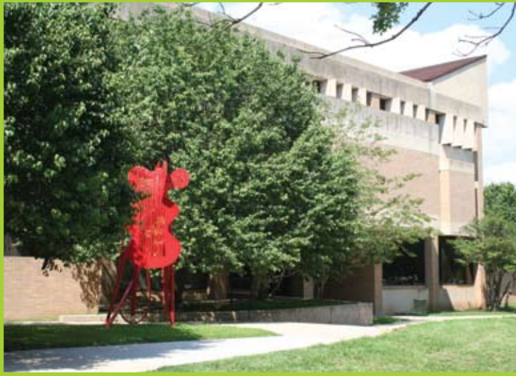
Sculpture: Mac Whitney, Carrizo , 1992

The Department of Art Education and Art History was very busy during 2007–2008. Throughout this newsletter, you will read about many individual and collaborative research, teaching, and service projects undertaken by our faculty, students, and alumni. The following are a few departmental achievements and milestones.