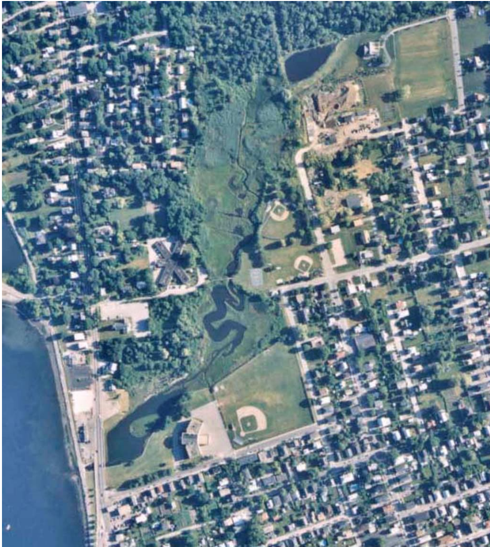
Figure 6. Aerial view of tidally restricted wetland in Bristol. Note road crossings at mouth and Phragmites marsh (gray-green color) in upper estuary.