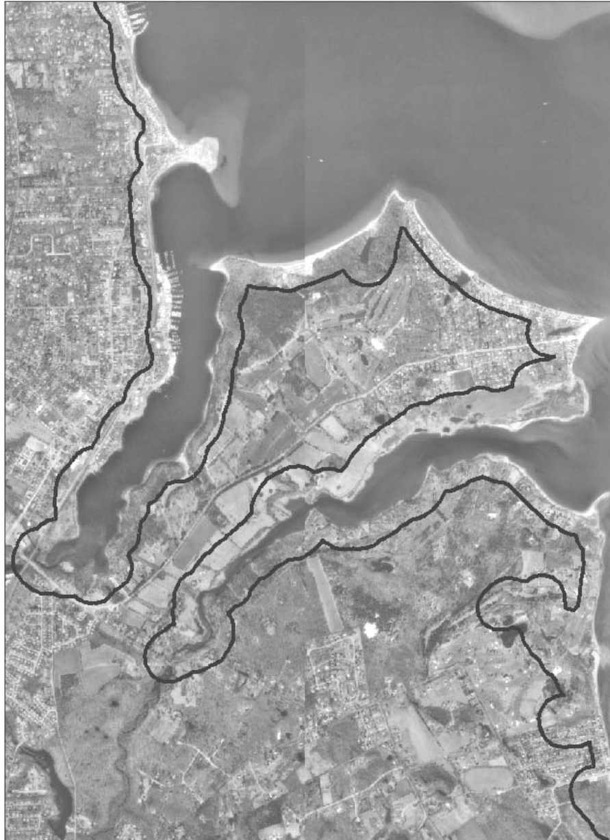
Figure 3. Aerial photograph showing approximate limits of 500-foot buffer area along Greenwich Bay. (Source: RIGIS).

code. This process identified 236 wetland restoration complexes for the Narragansett Bay Estuary (Helen Cottrell, pers. comm. 2003).