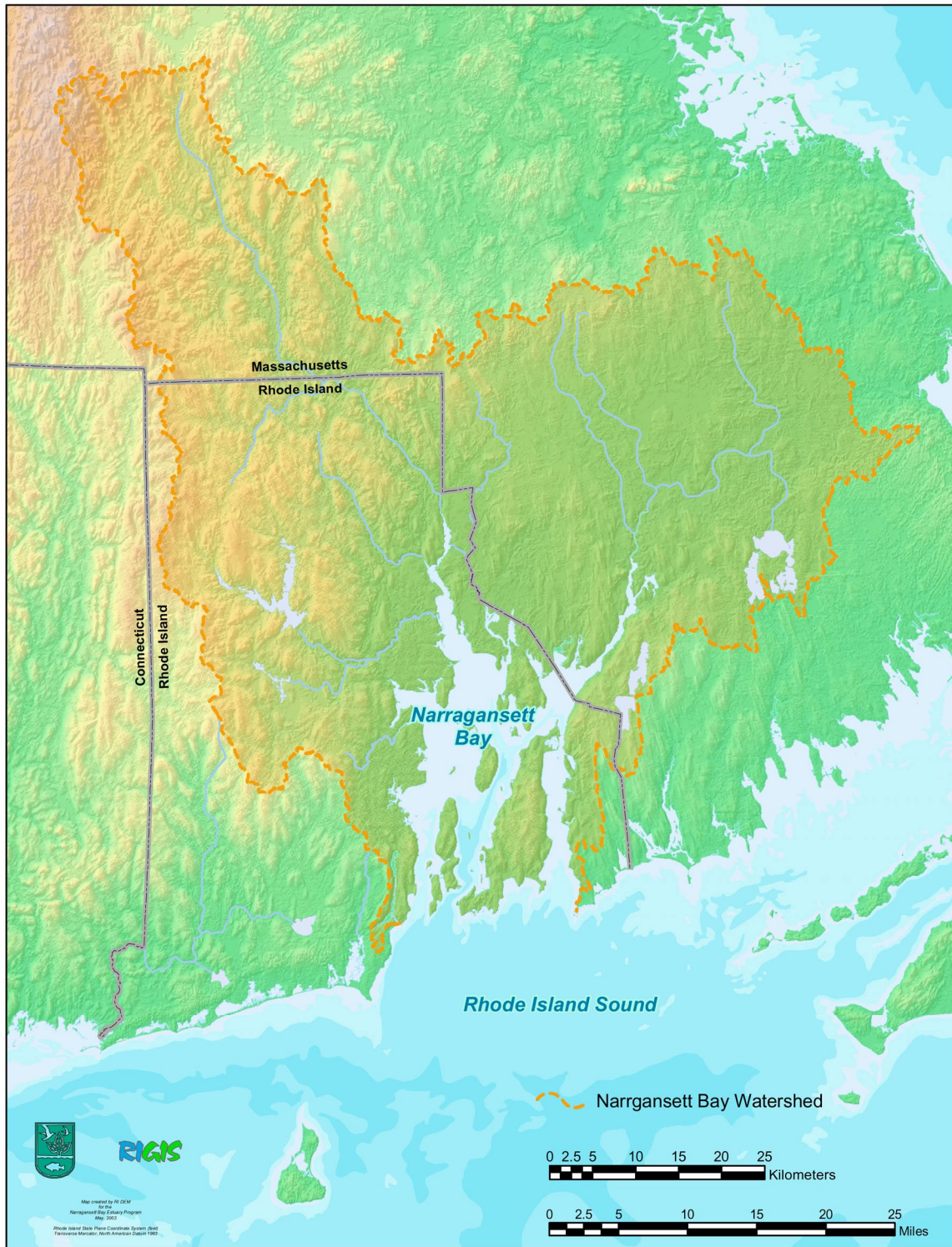
Figure 1. Approximate limits of the Narragansett Bay watershed.