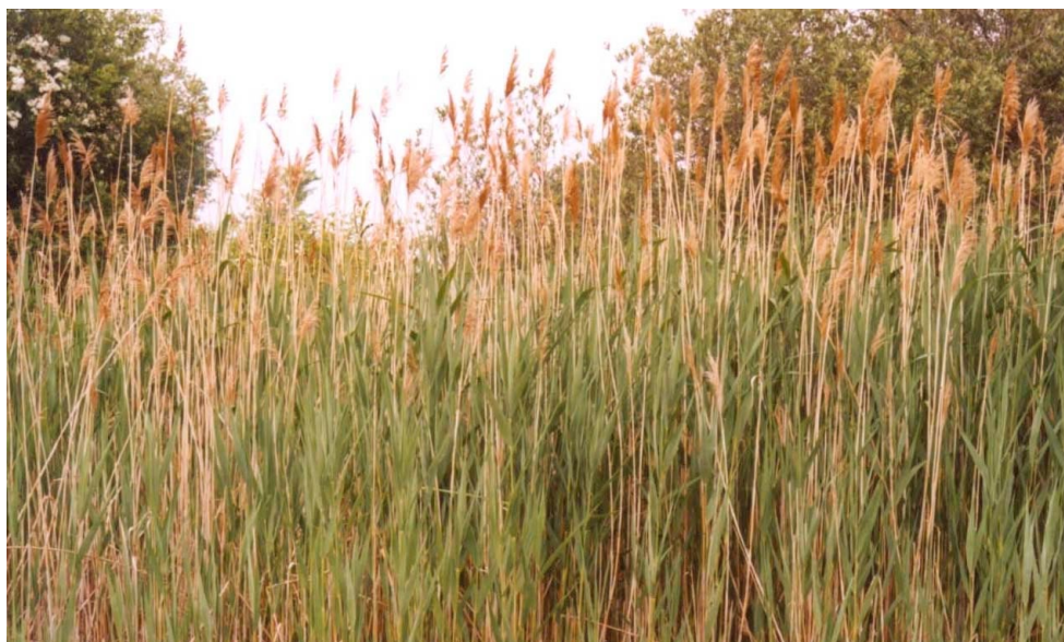
Figure 4. Phragmites -dominated wetland in Narragansett Bay Estuary.

Irregularly flooded emergent wetlands dominate the tidal marshes, representing 92% (3,281.5 acres) of these vegetated wetlands. Common reed ( Phragmites australis ) occurs in 473 acres and is the dominant species in over 340 acres (Figure 4). A total of 277 acres of regularly flooded emergent wetlands were inventoried. 2 Salt shrub swamps, typically dominated by hightide bush ( Iva frutescens ) account for only 5% of the estuarine vegetated wetlands.