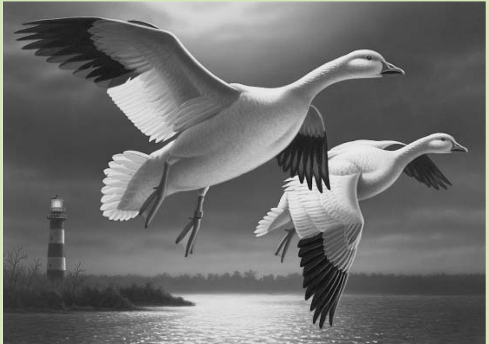
2002 Federal Duck Stamp Contest Winner

Please read all of the enclosed information very carefully and follow the instructions. If all instructions are not followed, your entry may be disqualified from the contest.