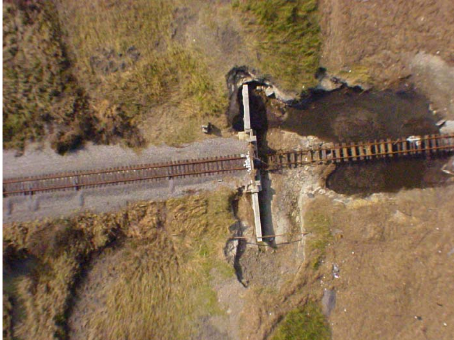
Figure 1 CSX Railroad gate (Photo S-1)

1. Railroad Floodgate : The CSX railroad floodgate and adjacent section of the levee were damaged during the storm event. There was scour of the structural fill material resulting from overtopping of the closure gate and levee.