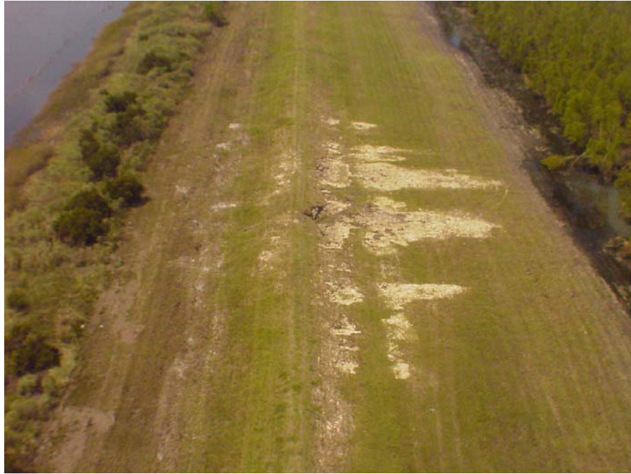
Figure 12 L/S Scouring of 600 ft reach (Photo S- 35)