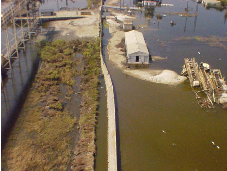
Figure 7 I-wall failed by rotation with attendant erosion and scouring. Quantity of materials removed estimated at 65,000 cys

The most severe damage in this reach is a 2000 ft. section of I-wall that failed by rotation, with attendant erosion and scouring. The extend of material below the water surface that has been removed by the scouring is unknown. Localized scouring occurred at several locations along this reach. The total quantity of material removed by scouring within this reach is estimated at 150,000 cys.