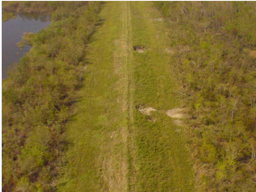
Figure 6 Localized scouring - typical of several locations (S- 22 thru 26 and 28 thru 31)