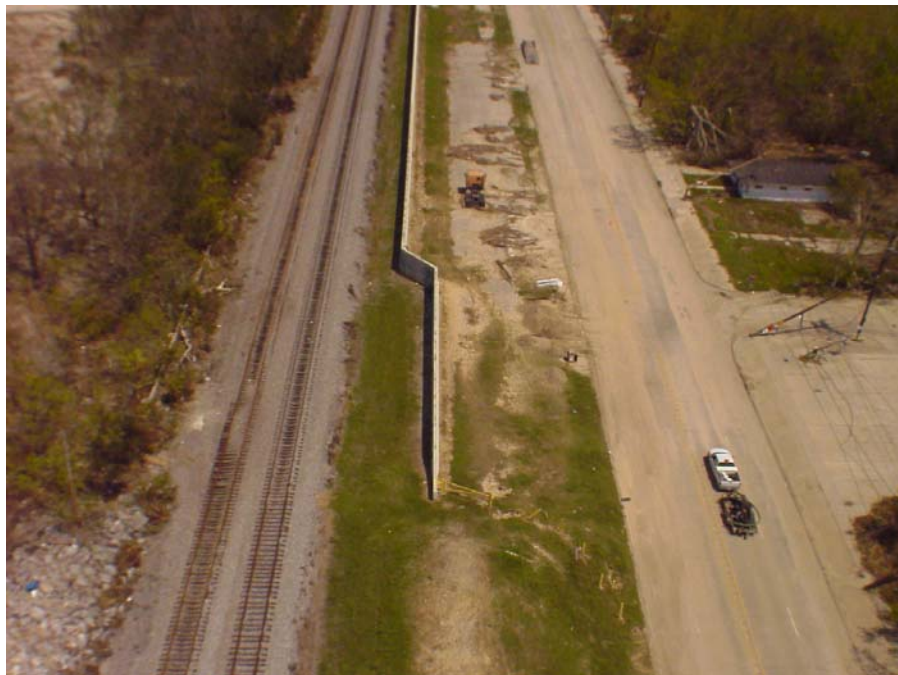
Figure 15 Minor scouring L/S of floodwall (Photo S - 53 and 54)