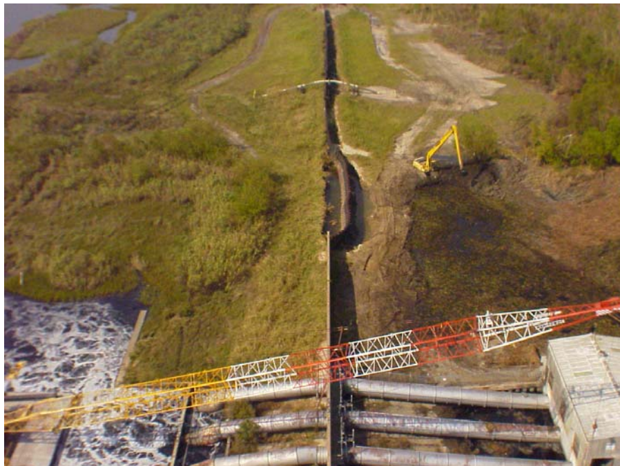
Figure 4 I-wall failure with erosion and scouring (Photo S-20)