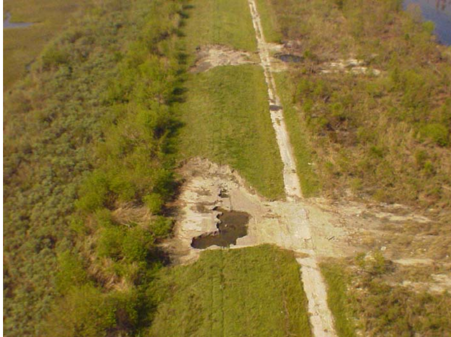
Figure 3 Partial breach east of Pump Station #15 (Photo S-8 thru 19)