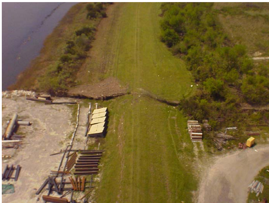
Figure 10 Narrow breach (Photo S - 34)