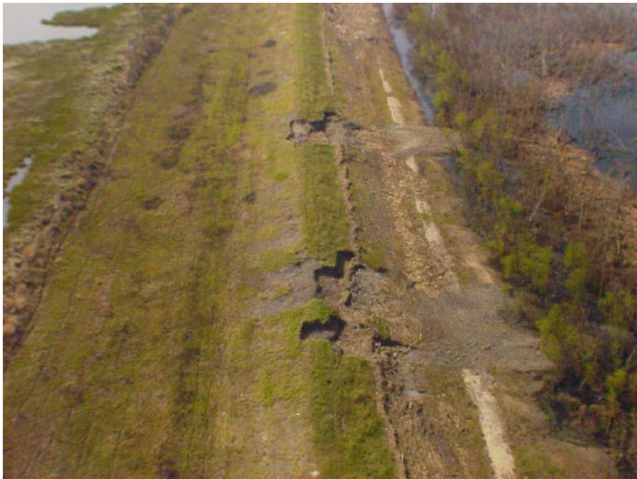
Figure 9 Major erosion of crown, river and land side slopes (Photo S - 4 and 5)