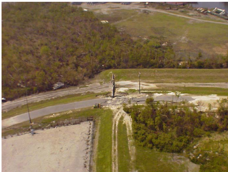
Figure 11 Scouring at closure structure and road (Photo S - 42)