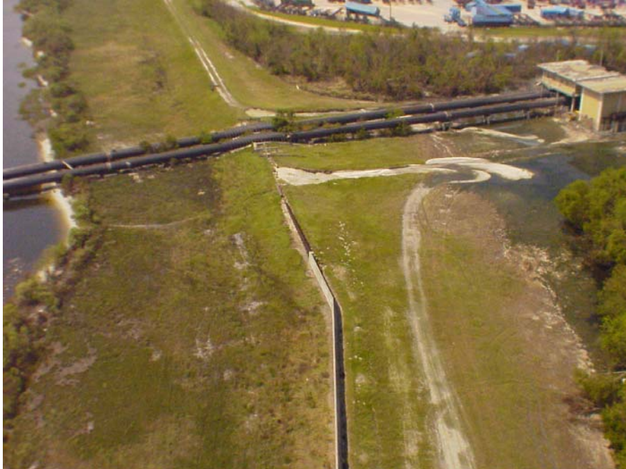
Figure 8 Land side slope erosion at utility crossing (Photo S - 38 thru 40)