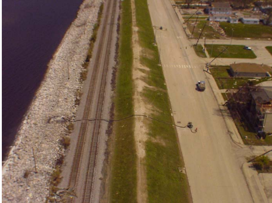
Figure 14 Crown and L/S scouring - typical of this reach (Photo S - 52)