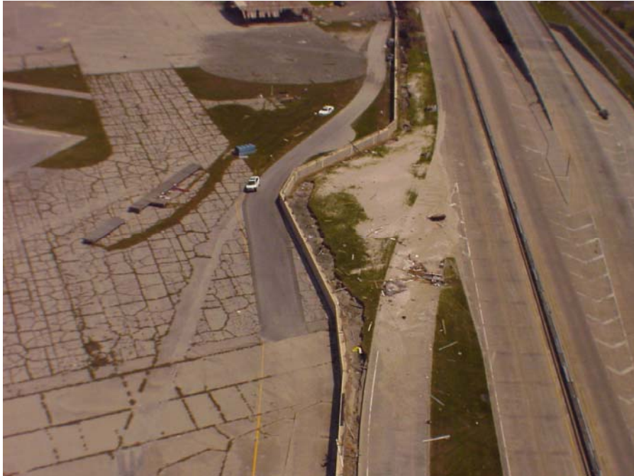
Figure 13 Scouring at N.O. Airport Floodwall (Photo S - 49)

The damage in this reach of the protection system is primarily scouring along the landside of the floodwall and levee sections at several distinct locations. The severity of the scouring varies from minor to severe. Scouring occurred, to some degree at each of the tie-in to the closure structures located within this reach. The total quantity of materials removed by scouring along the entire Lakefront reach is estimated to be less than 5000 cys.