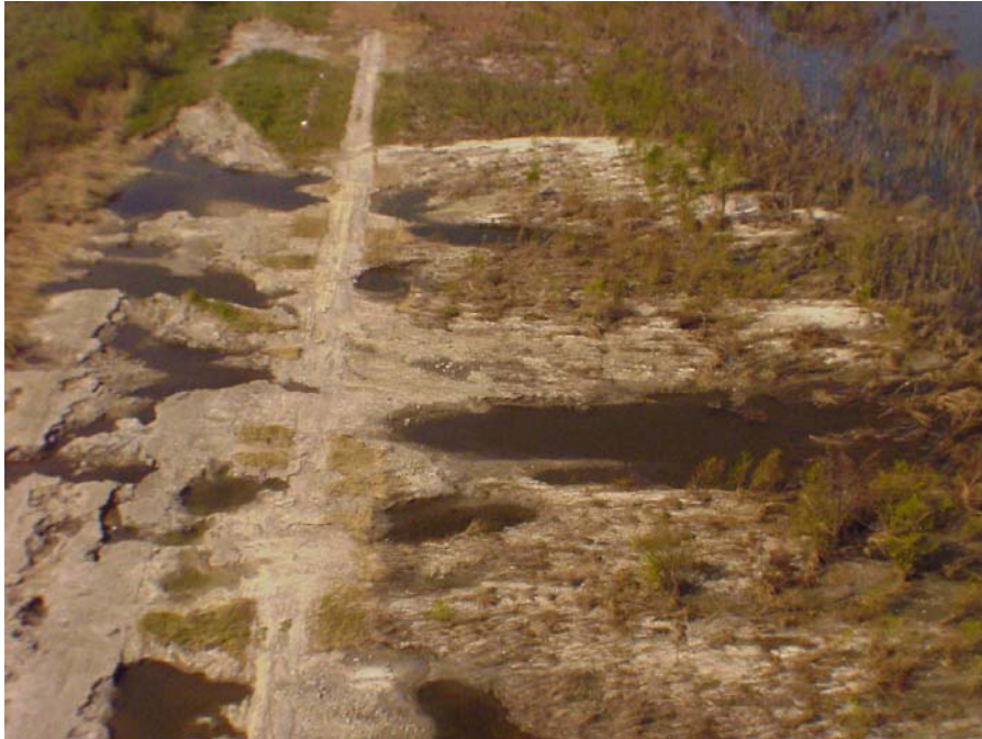
Figure 2 Intracoastal Waterway Breach east of Pump Station #15 - levee completely degraded (Photo S-7)

2. New Orleans East Back Levee: There is 12,750 feet of levee east of Pump Station #15 that is completely degraded. West of the pump station, 9,800 feet of levee is completely degraded. The remaining level of protection is EL 4.0. It is estimated that 400,000 cys of fill will be required to restore the degraded levee in the reach.