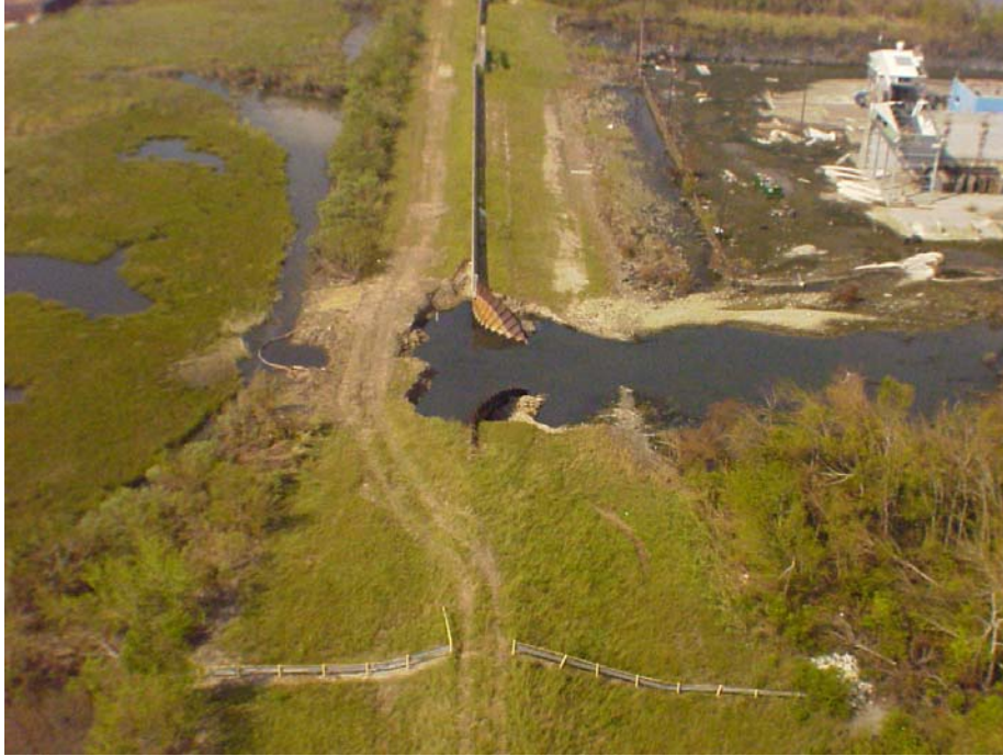
Figure 5 Hydrogen Plant (Air Products) Breach. I-wall failure (Photo S-32)