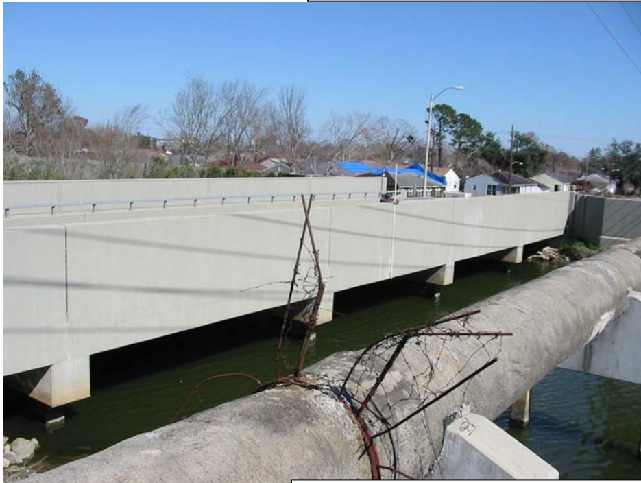
Low Chord London 6 Bridge 4.384 feet NAVD88 2004.65 Field Book 060854