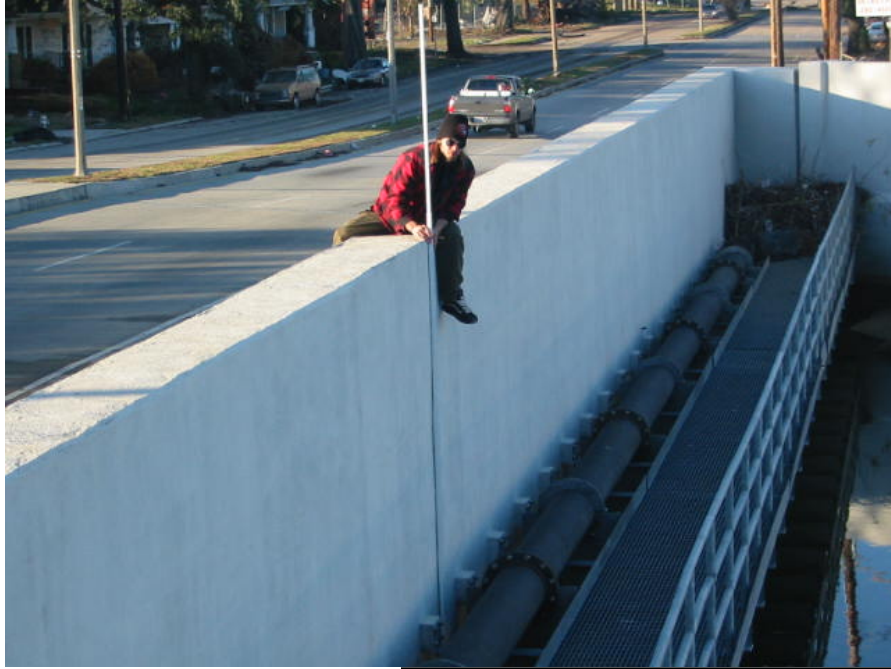
Low Chord London4 Gentilly -1 2.095 feet NAVD88 2004.65 Field Book 060851