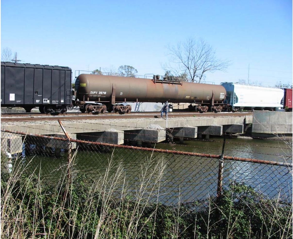
Low Chord London1 RR Bridge 5.771 feet NAVD88 2004.65 Field Book 060851