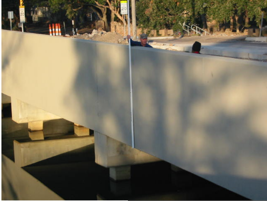
Low Chord London 5 Mirabeau 5.306 feet NAVD88 2004.65 Field Book 060851