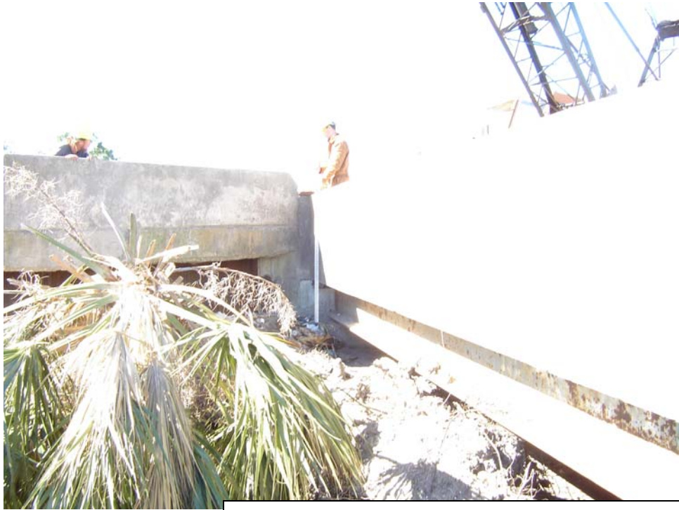
Low Chord London 7 Robert E. Lee #1 West 3.322 feet NAVD88 2004.65 Field Book 060854