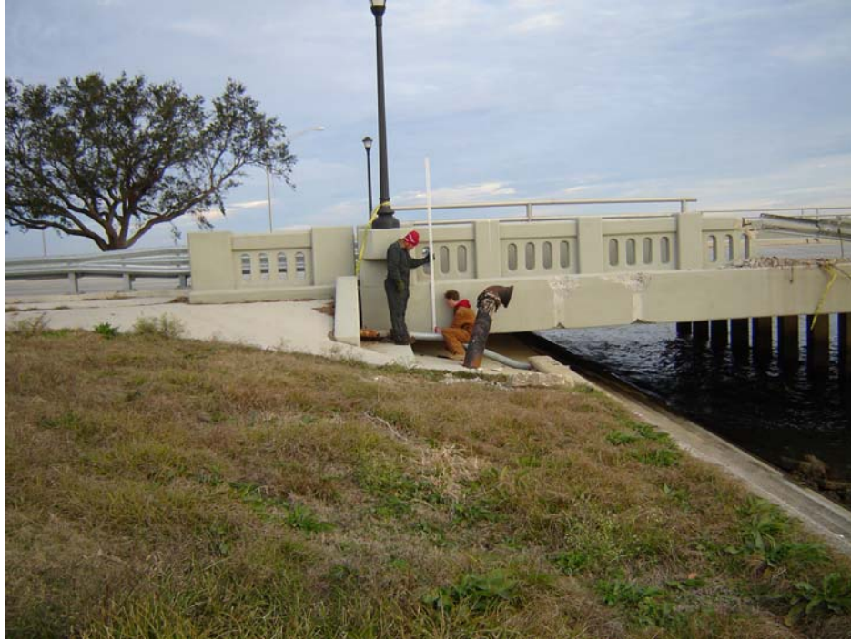
Low Chord London 9 Lakefront Drive #1 West 7.015 feet NAVD88 2004.65 Field Book 060854