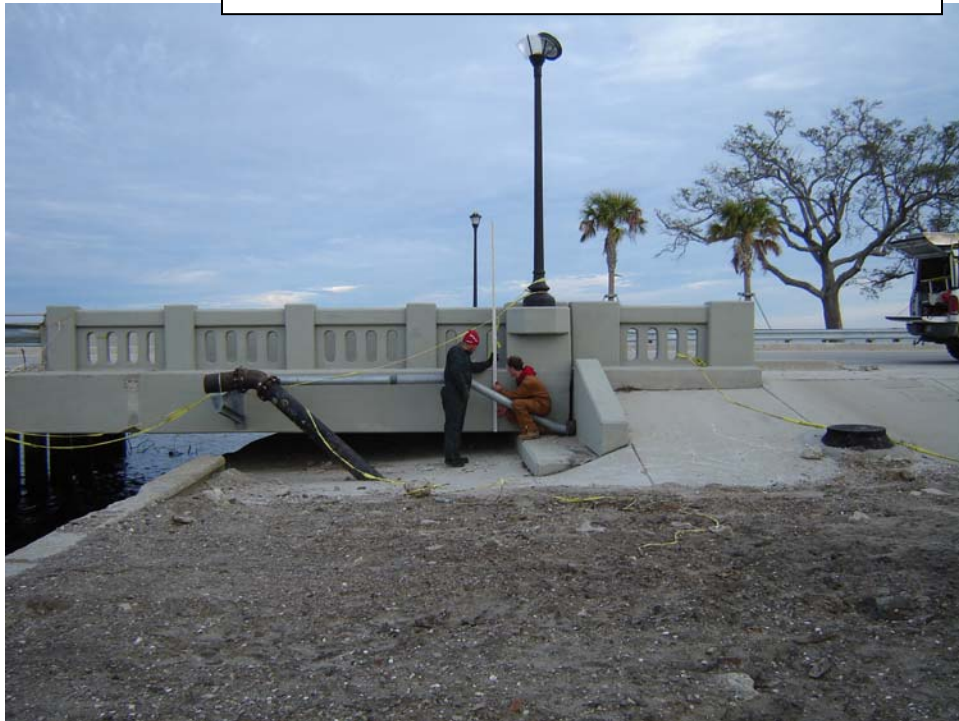
Low Chord London 9 Lakefront Drive #2 East 7.033 feet NAVD88 2004.65 Field Book 060854