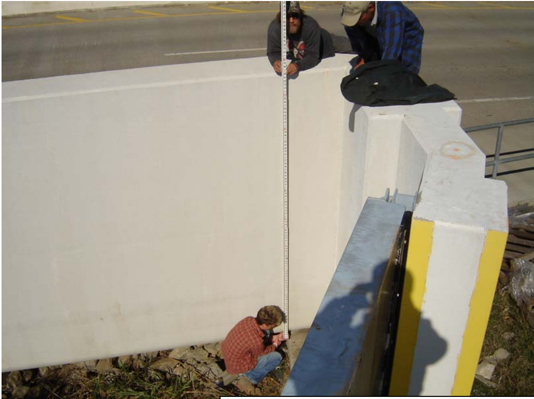
Low Chord London 8 Leon Simon #1 East 3.464 feet NAVD88 2004.65 Field Book 060854