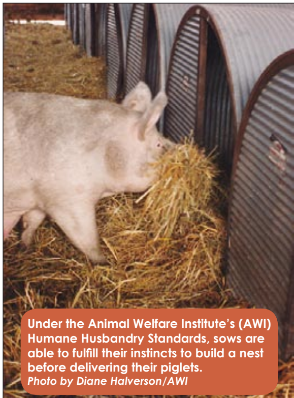
Under the Animal Welfare Institute's (AWI) Humane Husbandry Standards, sows are able to fulfill their instincts to build a nest before delivering their piglets.

Sustainable pork producers need to consider how the consuming public views their operations. Finishing and gestation buildings that restrict movement and interaction among pigs have become targets of media attacks. A sustainable system allows hogs a chance to pursue their natu-