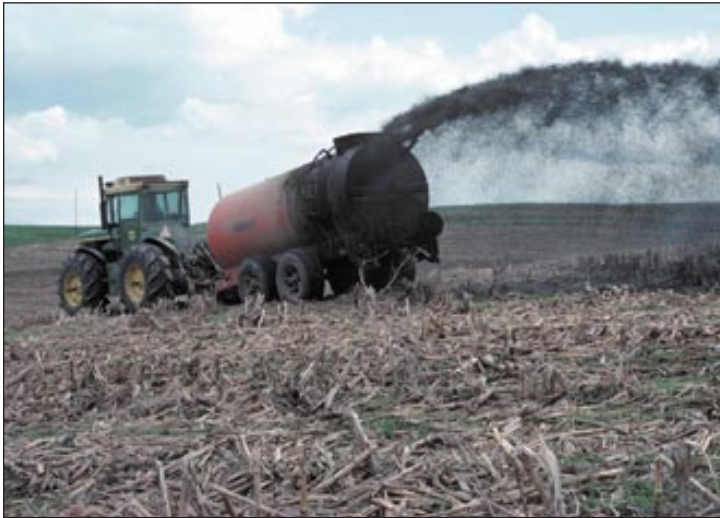
Liquid manure from a hog operation in northeast Iowa is pumped onto cropland.

Most complaints about hog operations involve odor. Many hog farmers are finding their odor control efforts are not meeting their neighbors' expectations. Because livestock operations are increasing in size, and more people are moving into rural areas closer to livestock operations, problems are increasing.(Anon., 2002b) One of the reasons odor causes negative reactions differently from person to person is that there is no consensus agreement between farmers and neighbors – or between any part of industry and the public – on how to evaluate odors. The total amount of odor coming from a farm depends on the type and number of animals, the type of housing, the manure storage and handling practices, the wind direction and speed, and many other weather variables.(Jacobson et al., 2002)