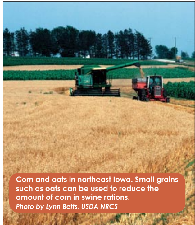
Corn and oats in northeast Iowa. Small grains such as oats can be used to reduce the amount of corn in swine rations.

If pastures are not available, feeding feedstuffs high in fiber is another possibility. Honeyman notes that studies show that fibrous feeds and protein by-products can make up as much as