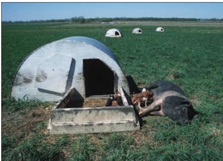
Hogs being raised on a pasture rotation system, Manhattan, Kansas.

Probiotics (live, beneficial bacteria) – available as gels, drenches, dry mixes, or for use in water – can replace or supplement naturally occurring gut microbes during times of stress or disease. During periods